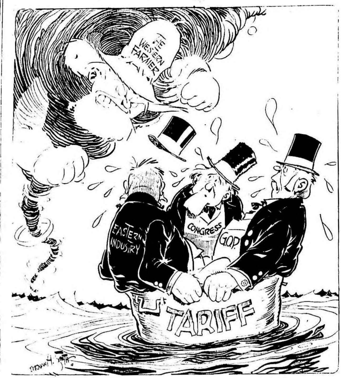
A FLORIDA MYSTERY TAMPA TRIBUNE