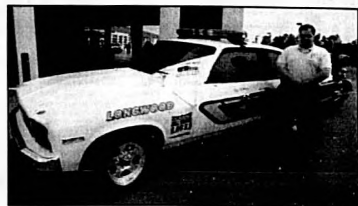
Longwood Investigator Ryan Bruce stands next to his 1976 Chevy Nova hotrod. The feared road machine is but one of many expected to be showcased at the June 26 Beat the Heat golf tournament.