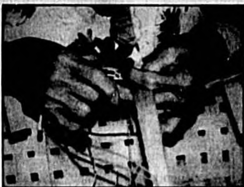
Evelyn Woods works on a basket. The 81-year-old said she can make a basket in one day and makes hundreds each year.

She does it a lot. Although she can't estimate how many baskets she makes during the year, she knows the number is in the triple digits. She makes sure she has at least 350 baskets to display at each of the five area arts and crafts shows she