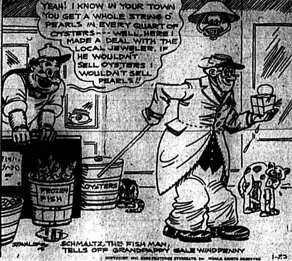
SCHMALTZ, THE FISH MAN TELLS OFF GRANDPAPPY SALE WADPENNY