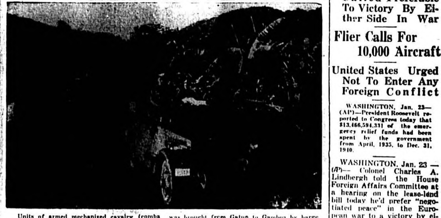
Units of armed mechanized cavalry (combat) speed through the banana country of Panama during a defense experiment in moving mechanized forces from the Atlantic to the Pacific, via the canal. The mechanized cavalry was brought from Gatun to Gamboa by large units of trucks and the cars traveled by highway from there to Rio Hato, 75 miles in the interior.