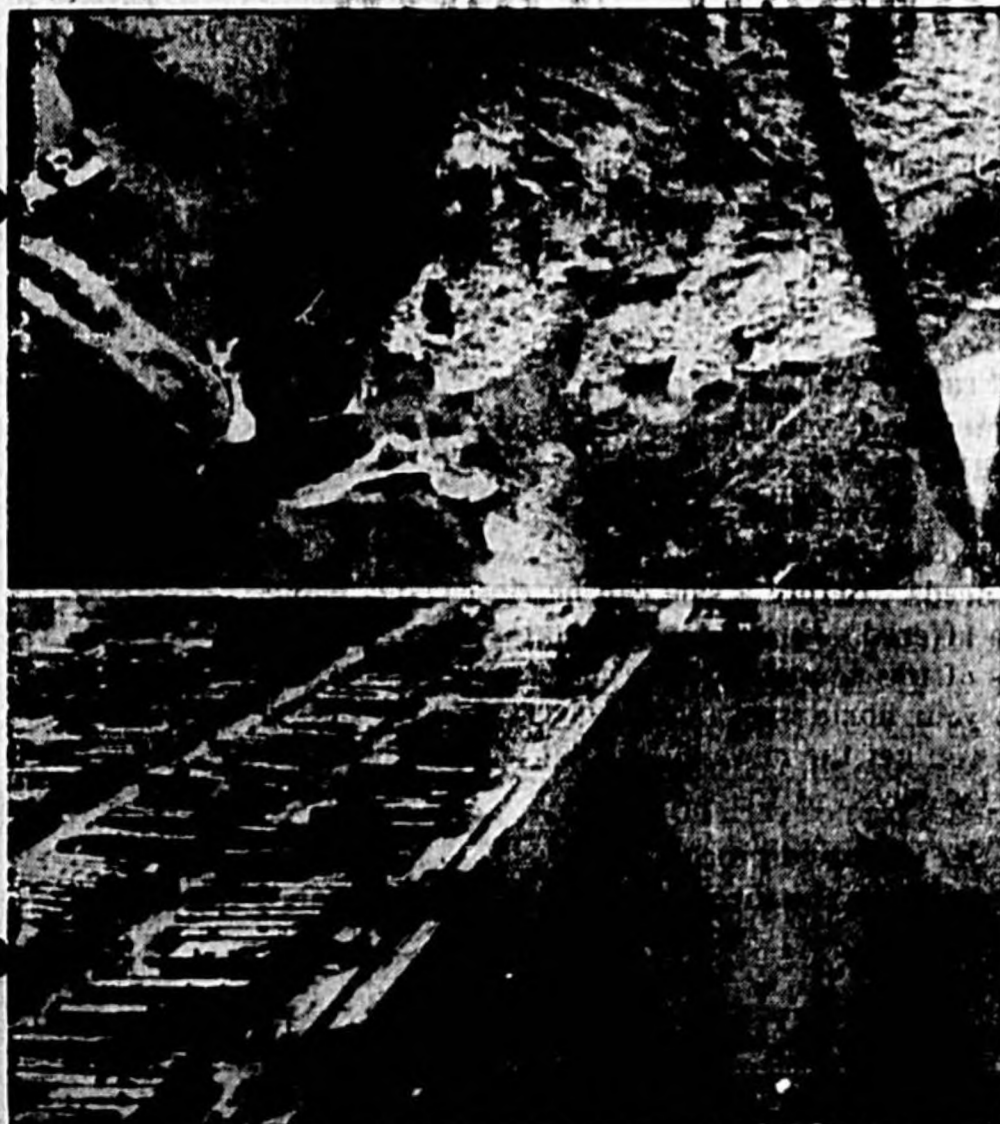
Army engineers dynamited the fine plug levee of the Birds Point-New Madrid floodway in hopes that release of the Mississippi river flood water would ease pressure on the dikes at Cairo, Ill. At the top, water is shown rushing through the breach to inundate the vast area in the floodway. Just before the blast, the Ohio river rose monastically on the 60-foot flood wall at Cairo (below). Women and children in the city were evacuated.