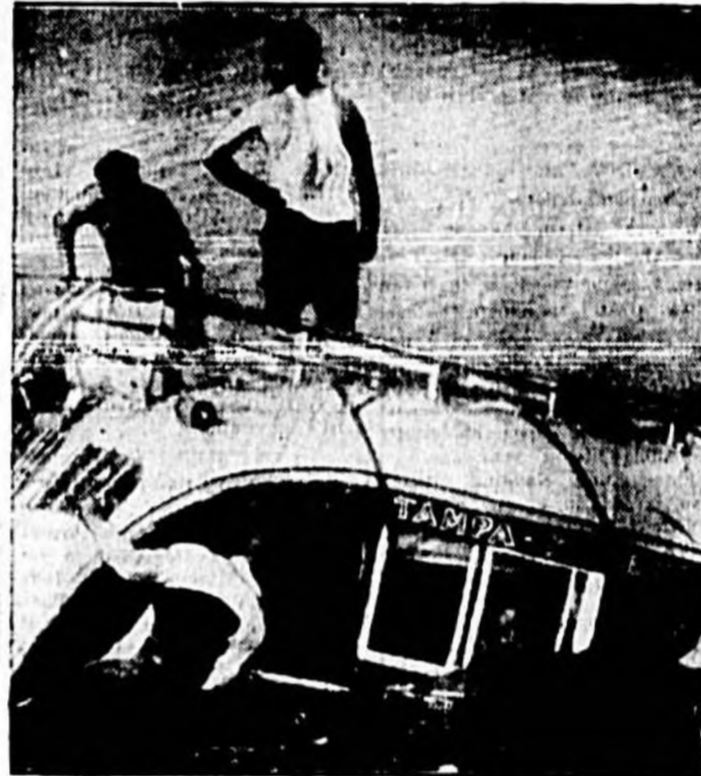
Bodies of most of the 17 victims were still inside as rescue workers struggled to raise this bus that had plunged into a canal on the Tamiami Trail near Miami, Fla. The big express bus was raised high before it sank to the bottom again.