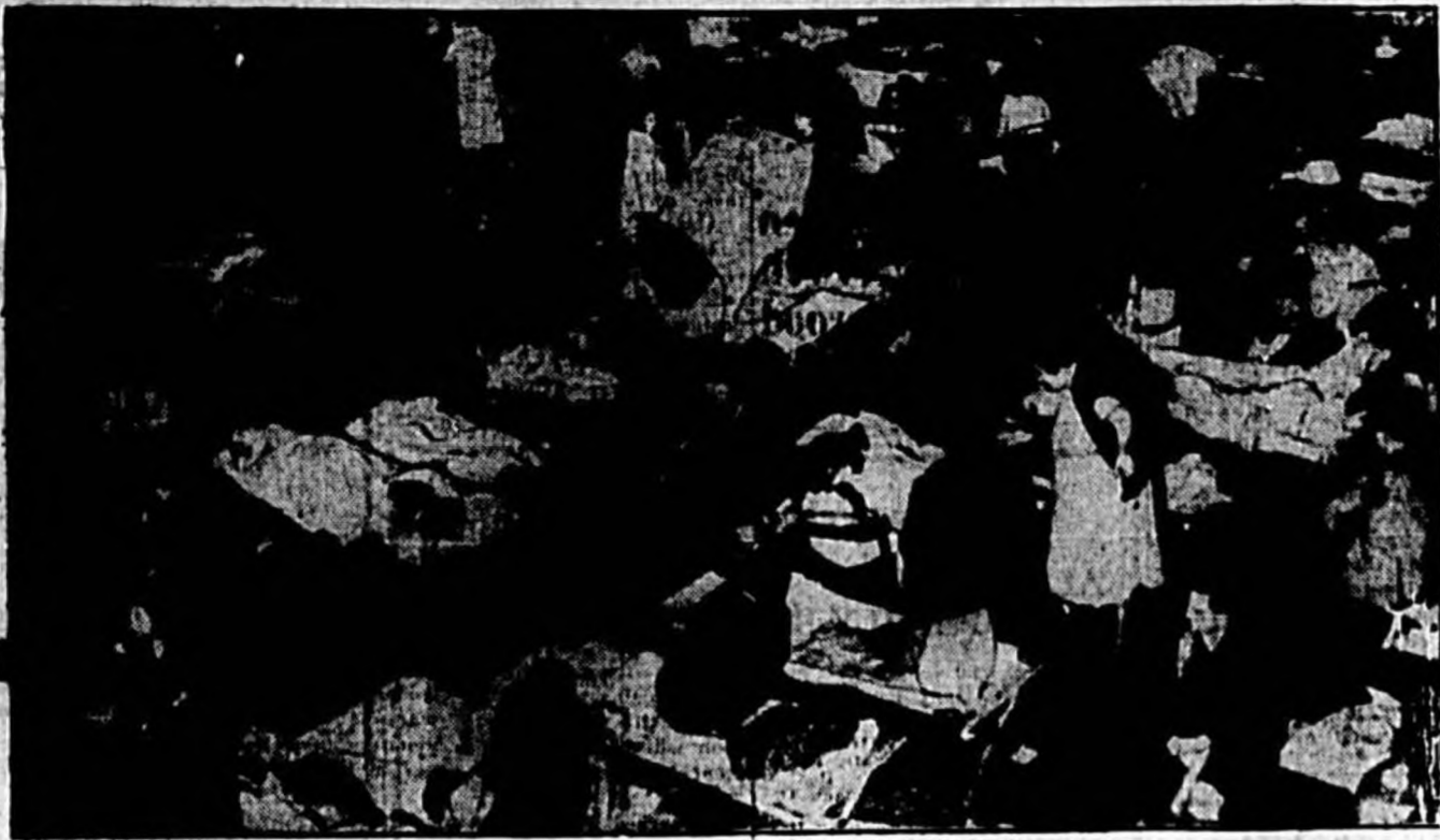
Of the 225,000 population of Louisville, Ky., 225,000 are homeless as the consequence of flood water inundating much of that city. Here are some of the 6,000 refugees sheltered in the city armory. Some of virtually all their possessions, they are dependent on relief agencies for food, clothing and places to sleep.