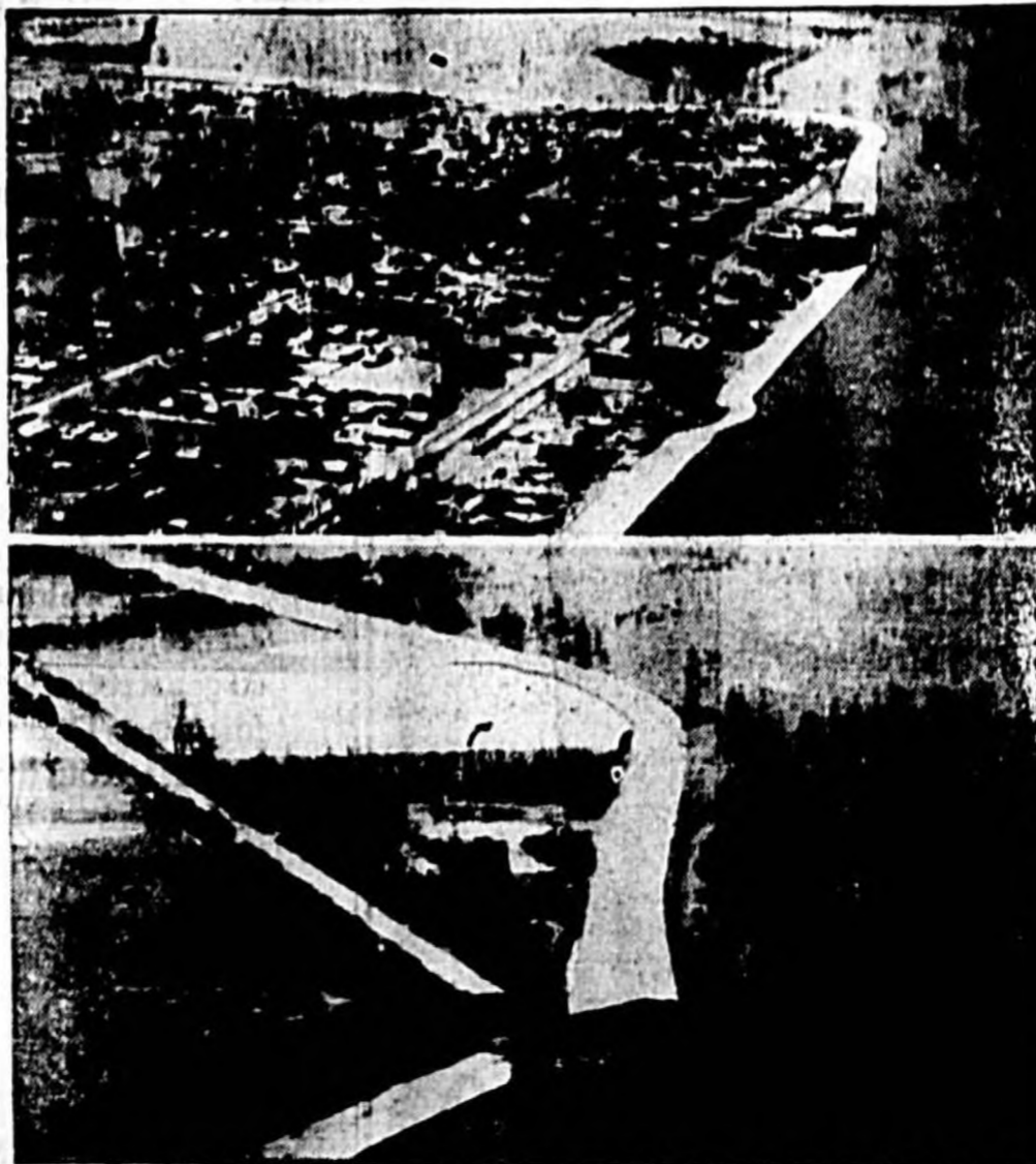
Besides being menaced on two sides by the flooded Ohio river, Shawneetown—oldest settlement in Illinois—was attacked from behind when back waters of the river broke a levee. Top, is shown part of the town and the levee on two sides as the Ohio makes a bend. Below, is the levee break which came at a point where a railroad crosses the dike.