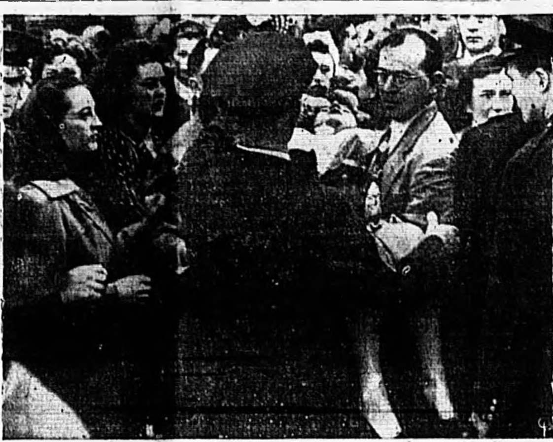
POLICE TRY TO CLEAR a path through a crowd in San Francisco as an unconscious woman is carried from the scene of a mass demonstration near the telephone company's main office. Two thousand striking phone workers had started to march on the building when police rushed to the scene in fifteen patrol cars and patrol wagons. Outbreaks occurred and forty of the demonstrators were arrested.