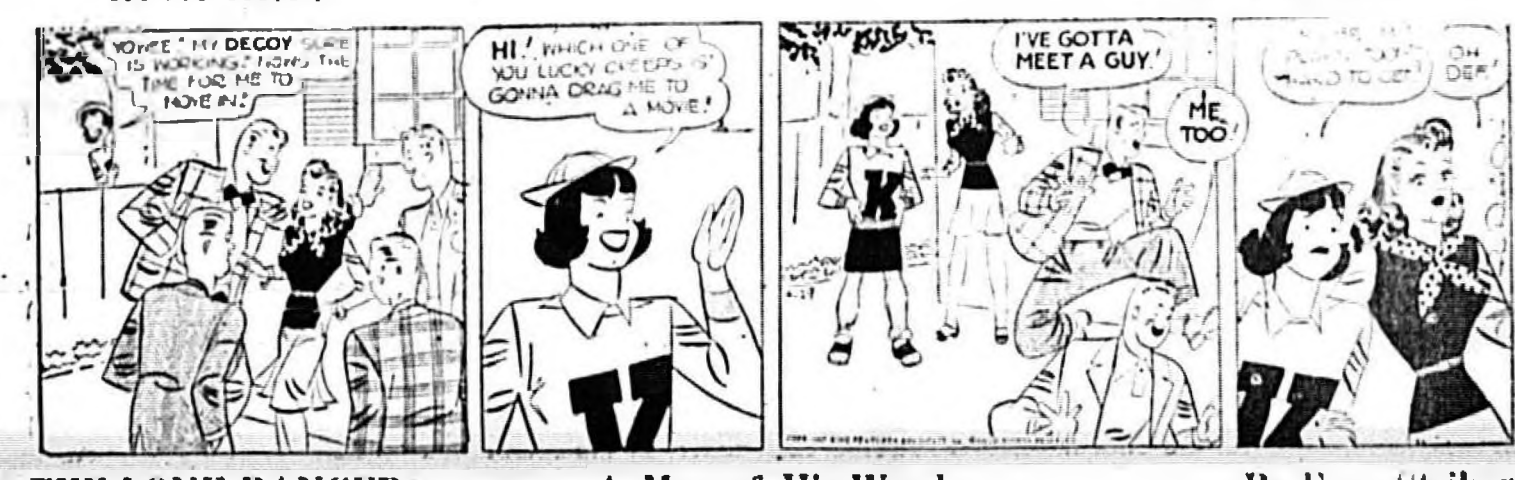
By Fran Striker