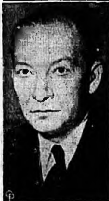
PRESIDING over the May-Garrison conspiracy trial in Washington is ... (Caption text continues)