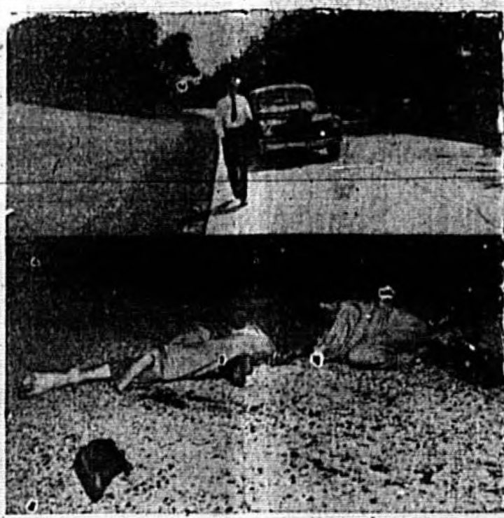
Except for a matter of timing and luck, the story of these two men is exactly the same. A few minutes before, the dead man was doing exactly the same thing as the happy looking pedestrian. They both gambled their lives by walking on the right-hand side of the highway. One lost and the other did not lose—yet. Police warn pedestrians to walk to the left of the highway, facing traffic. At night, walkers should wear something white or carry a flashlight. Motorists' headlights do not pick up dark clothing. Records show 195 pedestrians killed in 1945.