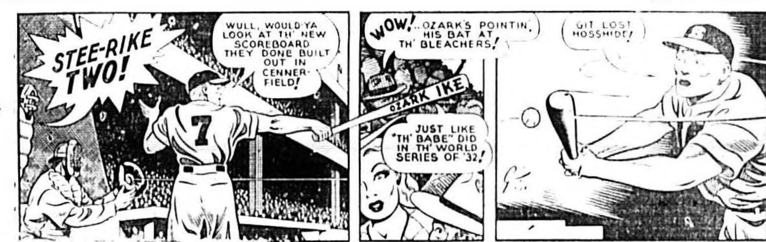
By Walt Disney