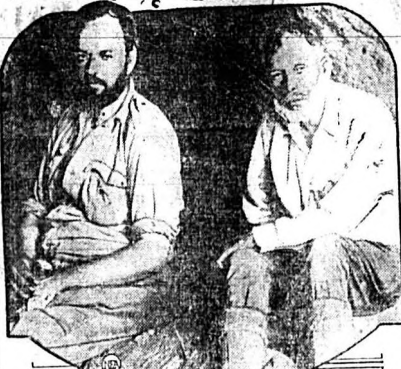
In a cave in the Mount Serabit district of Biblical Egypt, Professors R. P. Blake (left) and Kirsopp Lake of the Harvard expedition found the famous Serabit inscriptions now believed to be the missing link in the evolution of the alphabet. Some scholars are of the opinion that the inscriptions contain a message written by Moses to the daughter of a Pharaoh. The professors are shown at the mouth of the cave where the inscriptions were found.