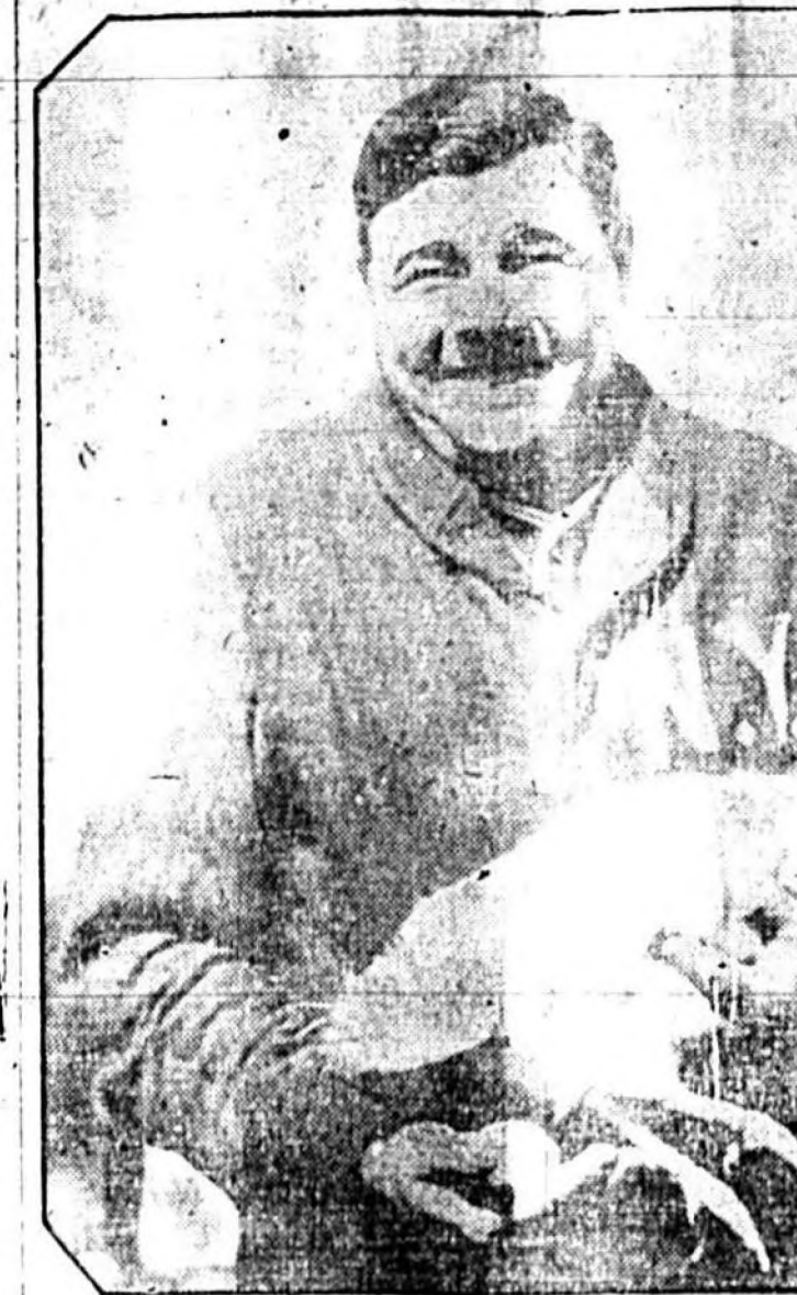
Here are two makers of records, Babe Ruth of the Yankees and Babe Ruth of Omaha, Neb. Babe of the Yankees broke his home run record this year, while the Omaha Bambino, whose real name is not Babe Ruth at all but Lady Norfolk, laid 172 eggs on 152 consecutive days and still was laying 'em at last report. The babe has been presented to Babe Ruth, who is a bit of a farmer in the off season.