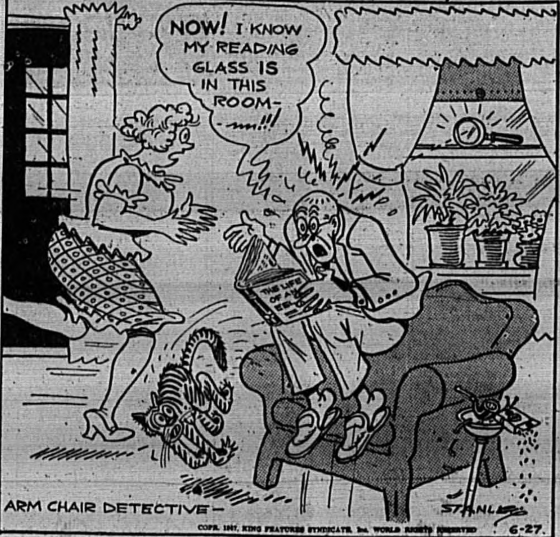
ARM CHAIR DETECTIVE - COPY. INT. KING FEATURES SYNDICATE, INC. WORLD RIGHTS RESERVED 6-27

Under certain conditions glass is as strong as iron. Zinc can be substituted for lime in the manufacture of glass.