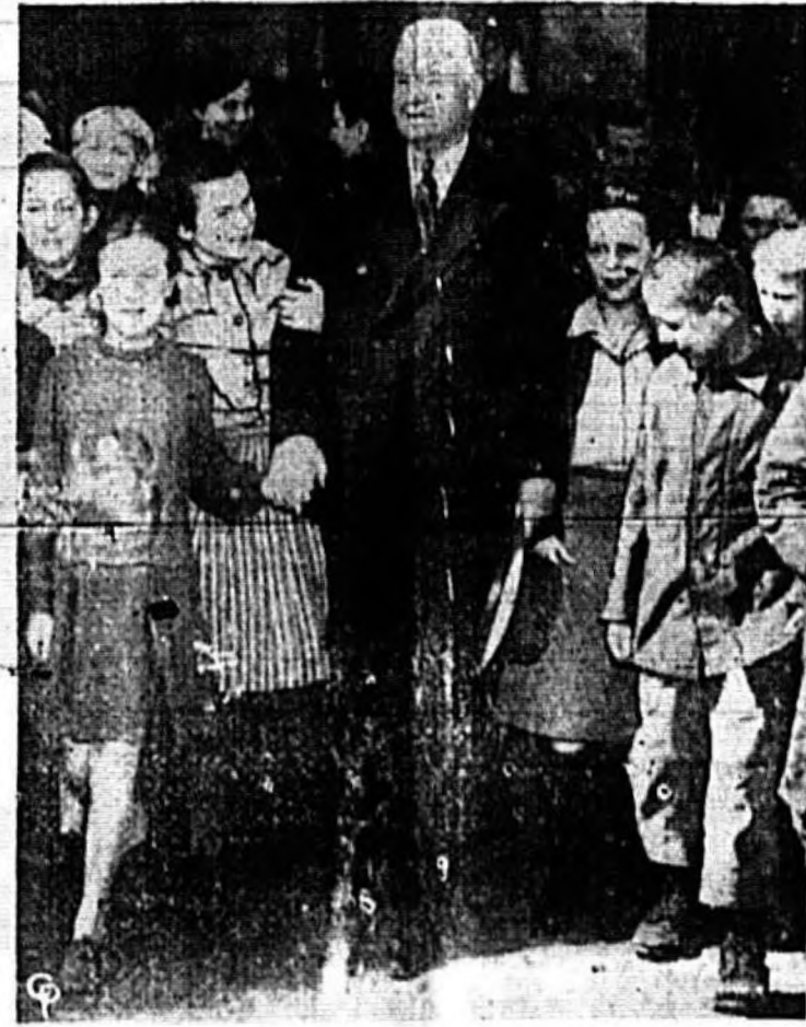
GRATEFUL POLISH YOUNGSTERS surround ex-President Herbert Hoover, as he later visited a school in Warsaw recently when the children he cared for in 11 camps can be found for them. Hoover is making a tour of Europe and needs for them. Hoover is making a tour of Europe and needs for them.

GRATEFUL POLISH YOUNGSTERS surround ex-President Herbert Hoover, as he later visited a school in Warsaw recently when the children he cared for in 11 camps can be found for them. Hoover is making a tour of Europe and needs for them. Hoover is making a tour of Europe and needs for them. Hoover is making a tour of Europe and needs for them.