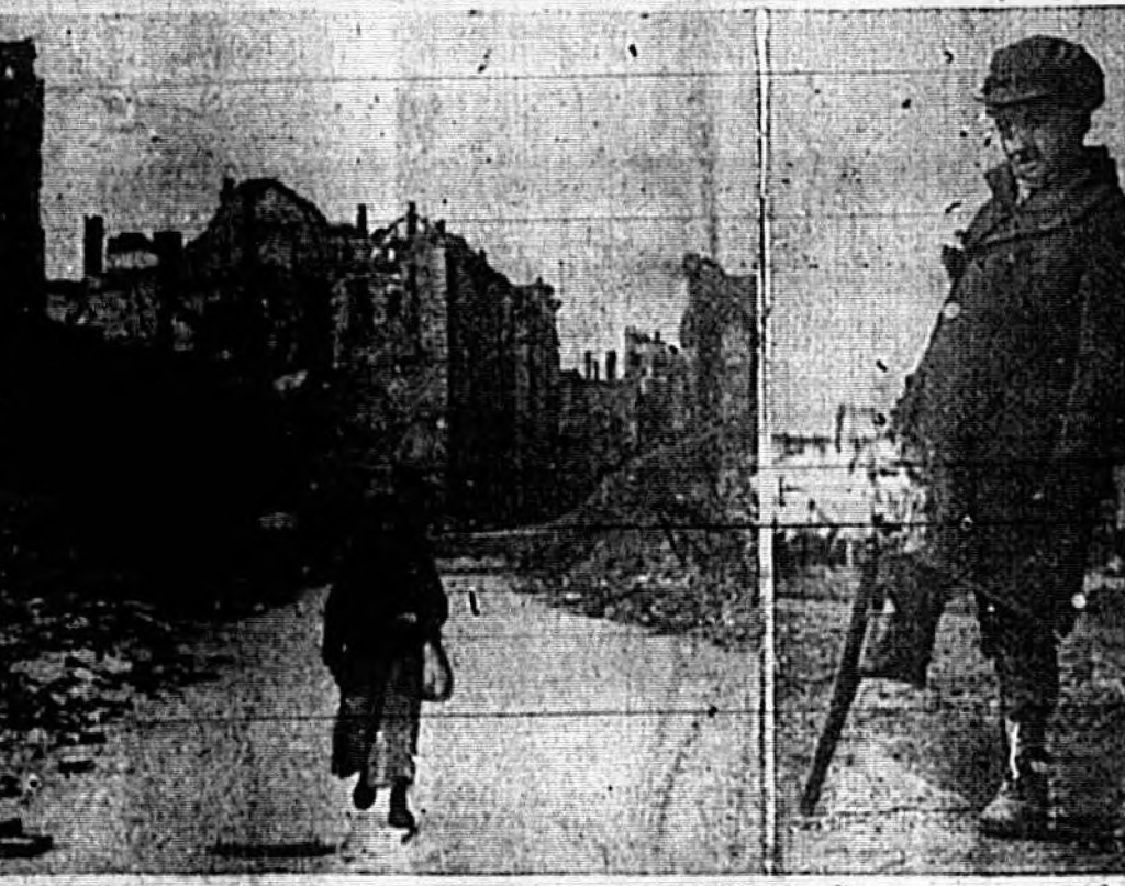
THE ONCE PROUD CITY OF WARSAW, Poland, is shown in these new exclusive pictures as it is today—nothing but complete desolation and ruin.