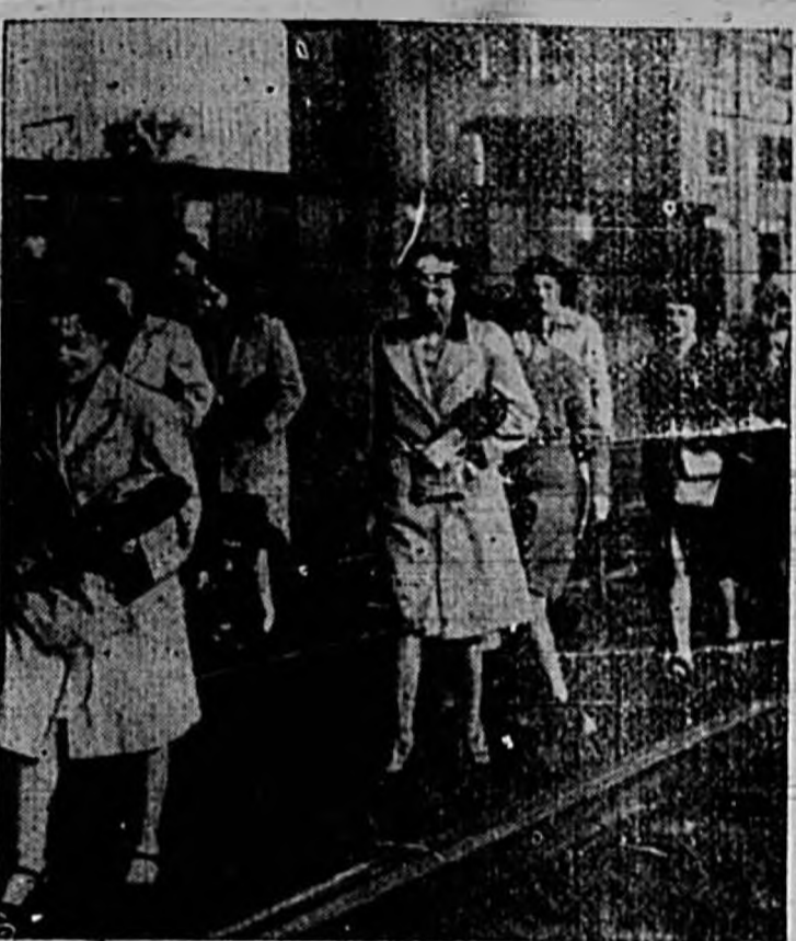
THESE YOUNG WOMEN, walking along the tracks of a Massachusetts Railroad, are on their way to work in Boston. Unable to get transportation because of the bus and trolley strike, they tried the railroad, only to learn that train service had temporarily broken down. So here are the girls heel-and-toeing to work.