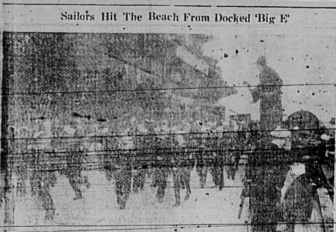
THE MOMENT THEY'VE BEEN WAITING FOR has come at last, and these crewmen of the U.S. fleet carrier Enterprise are getting away from the New York harbor. They took the big ship and began a long trip to Europe and back, first to Los Angeles and then on to San Francisco and the United States.