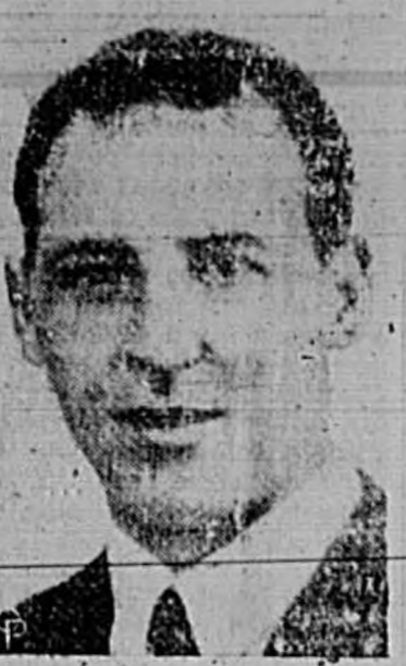
SOCIALIST Juan Attilio Bramuglia (above) has been named Argentine Ambassador to Russia. The appointment indicates that negotiations between Argentina and Russia are nearing success. Argentina has had no diplomatic relations with Russia since they were severed in 1917.

(Continued From Page One) left behind and others stoned and beaten in the little Tokyo district of Peiping last night in the first outbreak of violence here since the surrender of Jap forces. This followed similar disturbances in Tientsin where homes were entered and several hundred Japs beaten four days ago. The assassination yesterday of the President of Korea's chamber of commerce at Tientsin was reported today. There were no details. Japan's chief task is to carry out the terms of the Potsdam conference as smoothly and as rapidly as possible. Foreign Minister Shigemitsu, speaking yesterday in Tokyo, said to demonstrate our good faith through deeds in the first of a foreign press conference. He said he believed the present situation in the Far East is a "revision is regarded as necessary" because it had been misused by other elements in the past. He decided the "Yabatsu, the