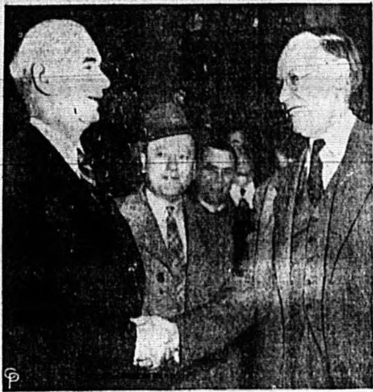
CIO PRESIDENT Philip Murray (left) is shown shaking hands with Sen. Robert A. Taft, chairman of the Senate Labor Committee, after Murray had testified before the committee in Washington in connection with proposed labor legislation. The CIO leader warned that restrictions on labor would preface a serious depression. He asked the Senators to help him and AFL President William Green work out an agreement for settling jurisdictional disputes.