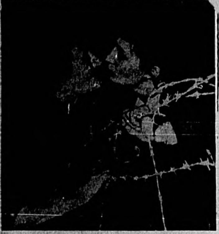
TAM DAYAN , daughter of Gen. Moshe Dayan, Israeli army Chief of Staff, leans over a barbed wire fence at a basic training camp near Tel Aviv to kiss her mother. Only military personnel are allowed to leave the barrier into the camp. Israeli women are now inducted into the army at the age of 18. Married girls are freed from military training, but many choose to serve.