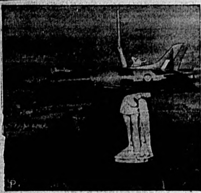
NOW FLYING with Britain's Royal Air Force squadrons of the Second Allied Tactical Air Force in Germany, the Vickers Swift F.R.3 appears to be taking on additional armament—a sword—as it flies past the Bismarck Memorial near Detmold, West Germany. It is claimed that the plane is the fastest low-level, fighter reconnaissance jet in any air force. The craft carries cameras in the nose and is armed with two 30 mm. guns.