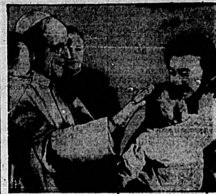
POPE PIUS XII is bestowing his blessing on an American mother and her child at the audience given by the Pontiff at Vatican City, Italy, to 51 new American priests and their relatives.

The fifth grade at Town School was taken to hear its first orchestra concert. On the way home the teacher asked one scholar, "Did you prefer the strings or the brasses?" The scholar answered, "The one I liked best was the harpoonist."