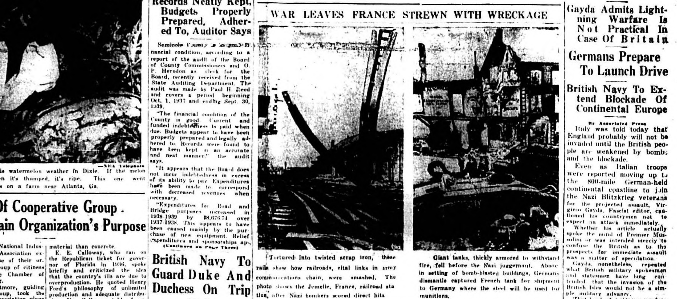
WAR LEAVES FRANCE STREWN WITH WRECKAGE

Italians are told not to expect an immediate attack. The financial condition of the country is poor.