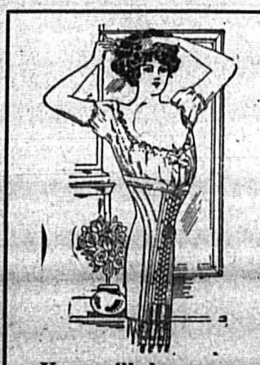
You will have no trouble to find what you want out of our four popular lines.