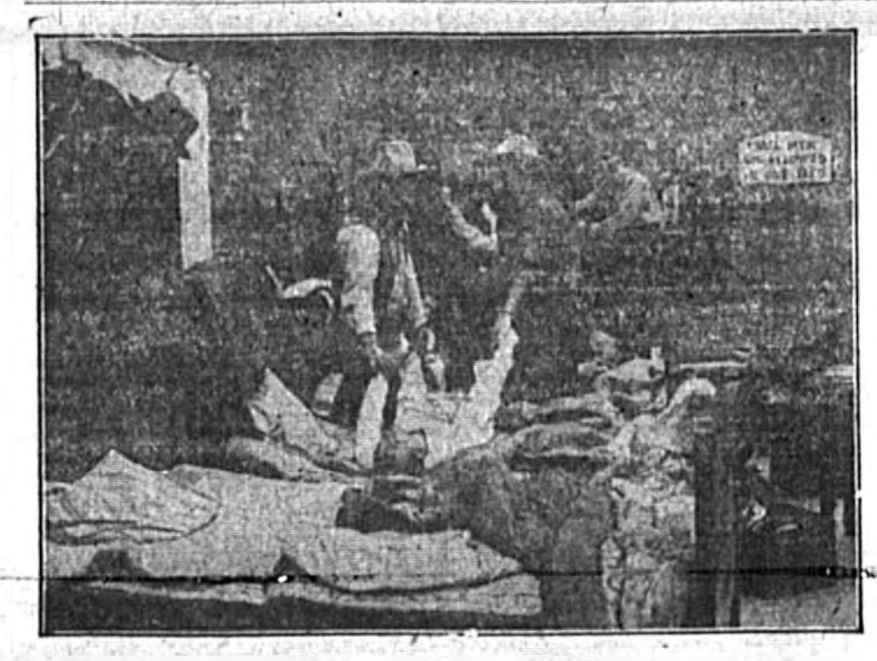
THE VIRGINIAN AT THE STAR MONDAY, MAY 24th