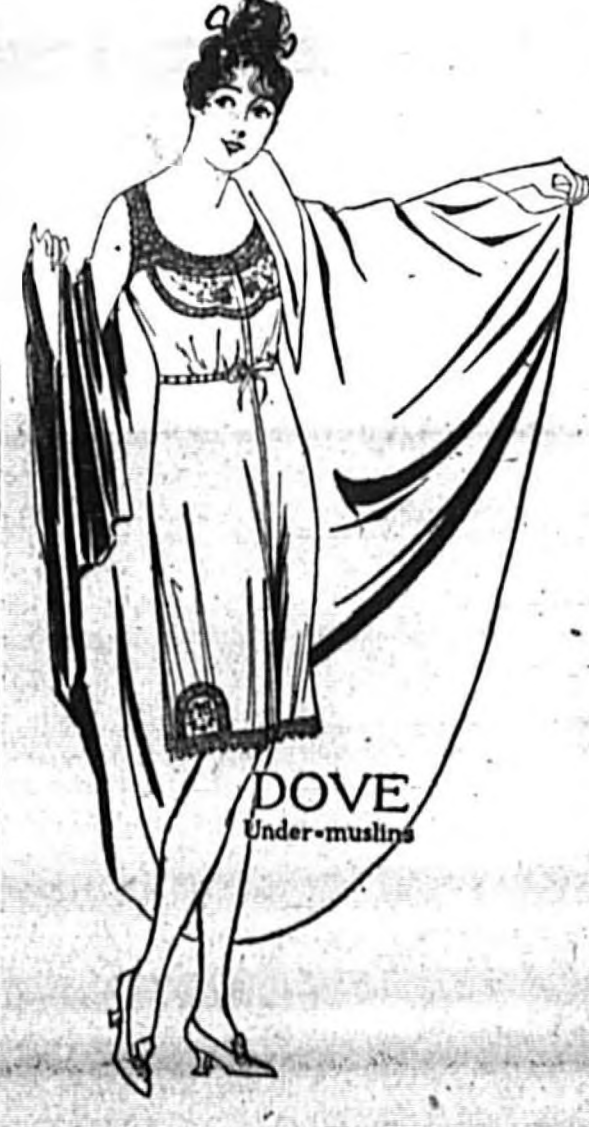
Complete stock of this dainty underwear at very reasonable prices