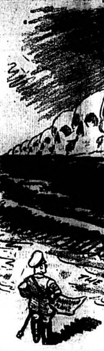
Illustration by [Artist Name]