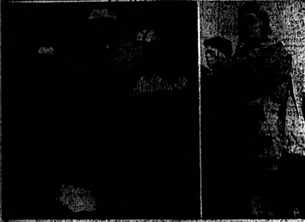
At the naval air station at Lakeland, N. J., Marines practice massed parachute landings. Men carry two crates, one regular on their backs, one emergency on their chests, as shown, right. Top, leatherbacks slip from their plane into space. Bottom, they touch the ground. After training, they discard emergency chute.