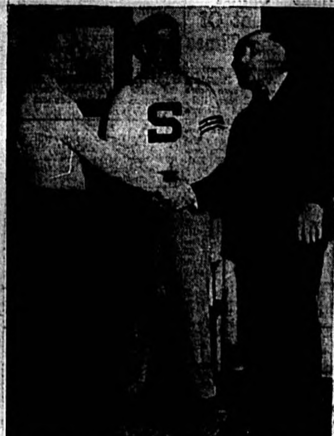
DELAND, Feb. 18.—(Special)—When Stetson University's administrators decided recently to announce the abandonment of intercollegiate athletics...

MIAMI, Feb. 19.—(S)—A top-seller among laxatives all over the South for years—Black Draught.