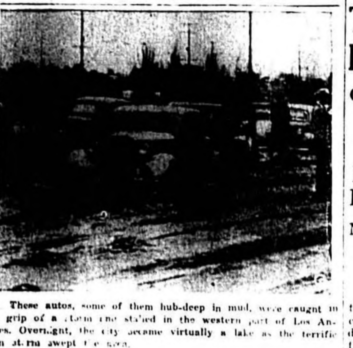
These autos, some of them hub-deep in mud, were caught in the grip of a storm that stalled in the western part of Los Angeles. Overnight, the city became virtually a lake as the terrific rain at first swept the area.