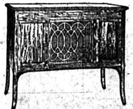
Baby Console Model $185.00

As You Pay A small initial payment will place the model of your choice in your home for Christmas, and the monthly remittances are so small that you will hardly notice them.