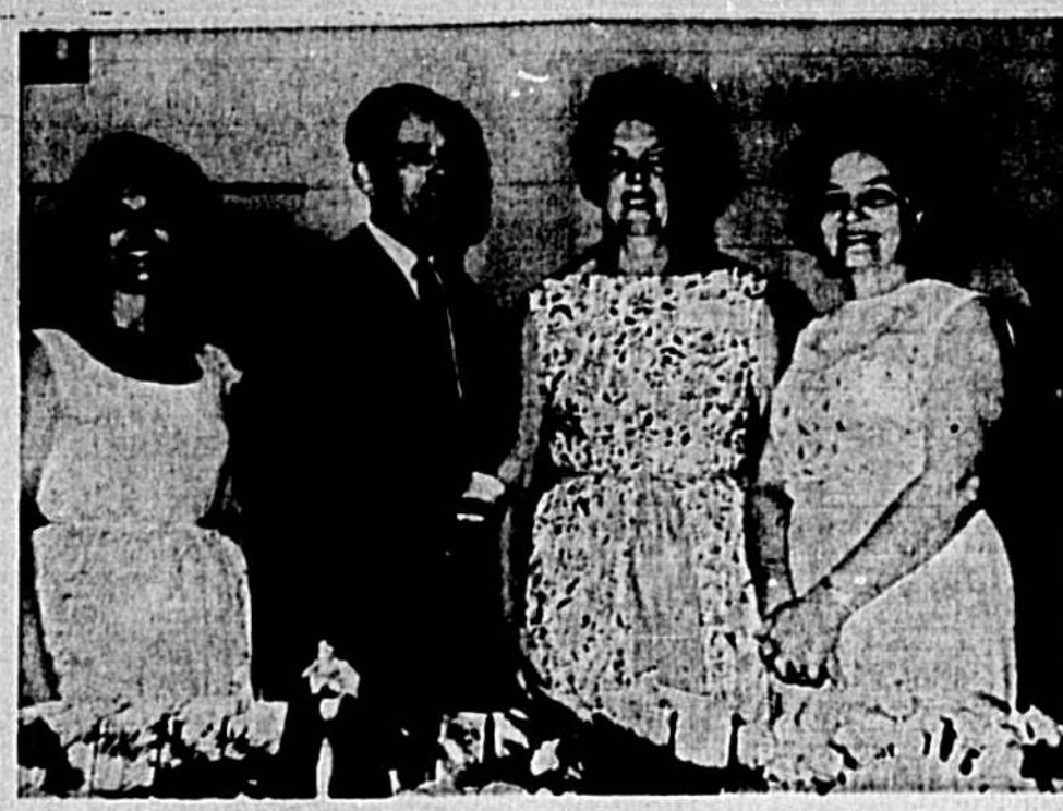
FACULTY MEMBERS at South Seminole Junior High School in Casselberry were entertained by the Parent-Teacher Association...