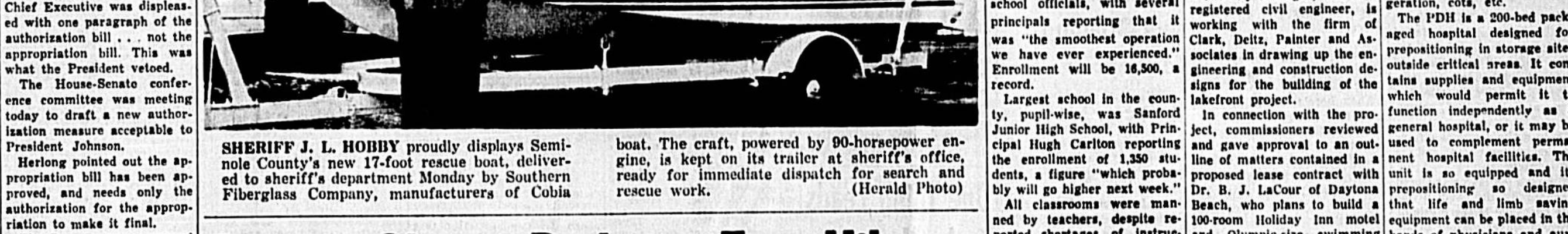
SHERIFF J. L. HOBBY proudly displays Seminole County's new 17-foot rescue boat, built by Southwestern Fiberglass Company...