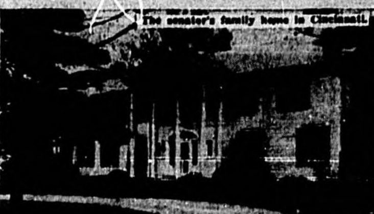
The senator's family home in Cincinnati.