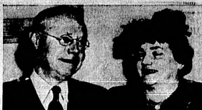
"Mr. Republican" and his favorite aide—Mrs. Taft.