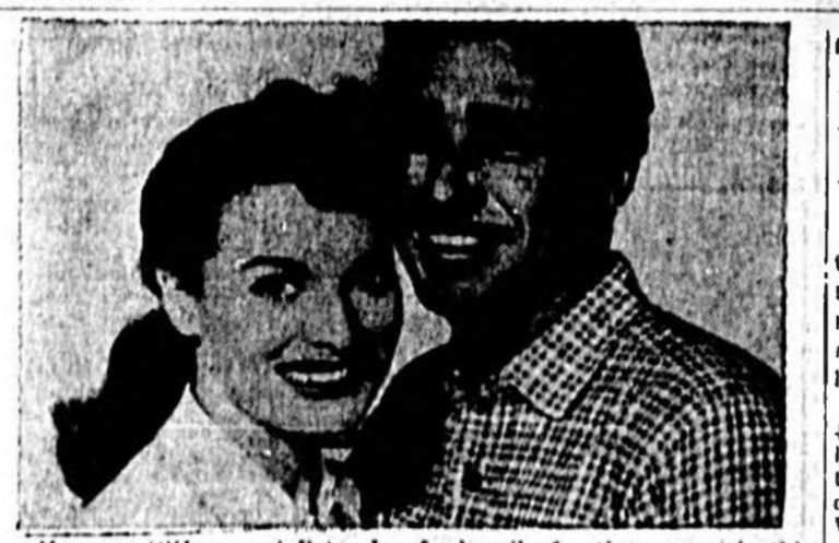
Maureen O'Hara and Peter Lawford smile for the camera in this romantic scene from 20th Century-Fox, "Kangaroo." Technicolor, showing on the Ritz Theater screen Thursday and Friday.