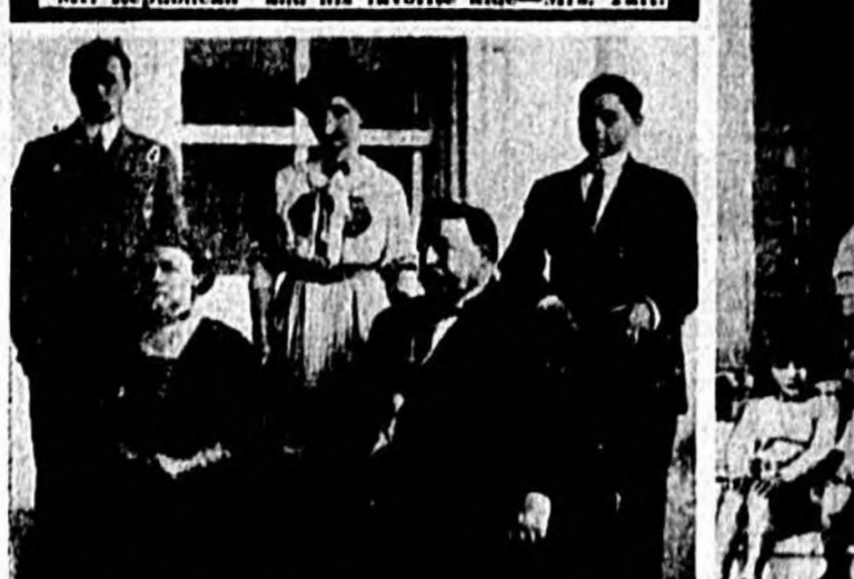
Young Bob (left) lived at the White House with his father, President William Howard Taft.