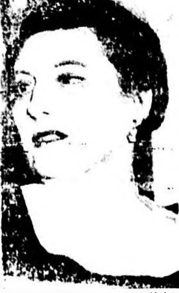
Metropolitan Opera singer Helen Traubel is shown as an engaged bride in a scene from the new production of 'The Merry Widow' at the Metropolitan Opera house.