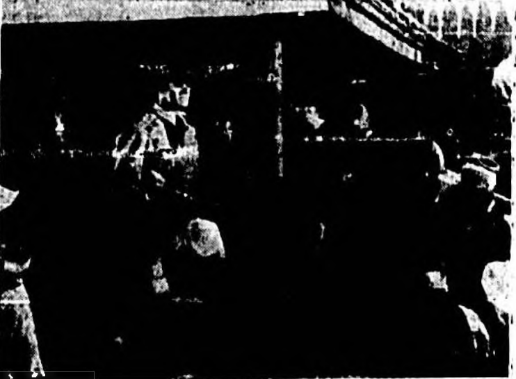
Red Cameron and Iona Massey in 'The Thunderers' at the Movieland Road-In Thursday and Friday.