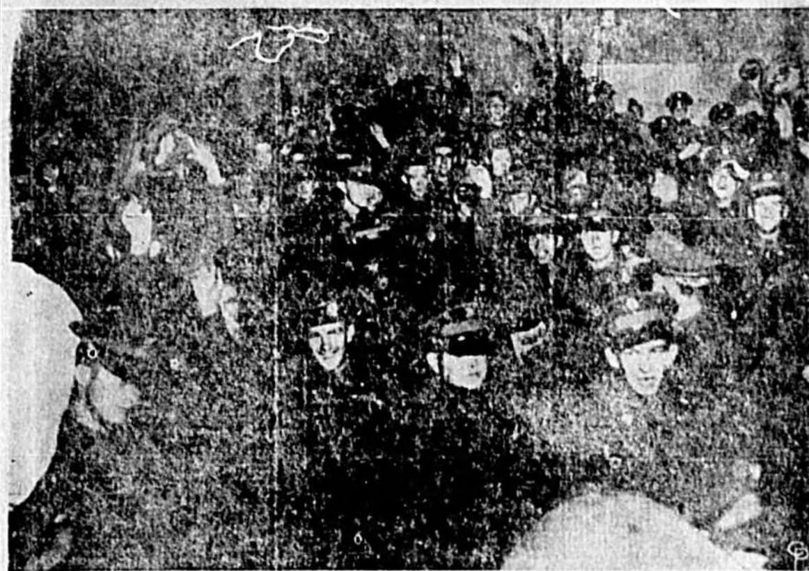
WAVING A FAREWELL to relatives and friends, these U. S. soldiers board the military sea transport service vessel General Nelson M. Walker in San Francisco. They are en route to the Far East to aid Americans fighting in Korea. Shoulder patches indicate they are either soldiers and Air Force men.