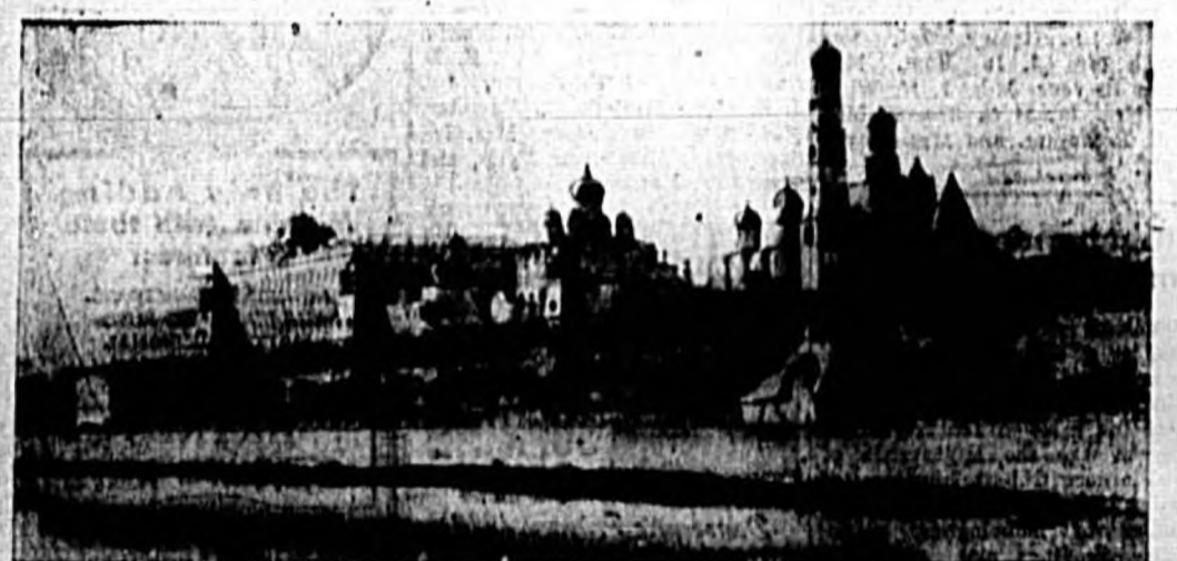
RUSSIA, BAPTIZED IN BLOOD OF REVOLUTION which in 1917 wiped out Imperial Russia, has put 21 prominent Bolsheviks on trial in Moscow, according to the fragments of a plot to capture the historic Kremlin (above), kill Dictator Josef Stalin and other Soviet leaders in a military plot, and restore capitalism. The present trial in which death for the defendants is inevitable, climaxes a series of Russian "purges" with an unestimated loss of life.