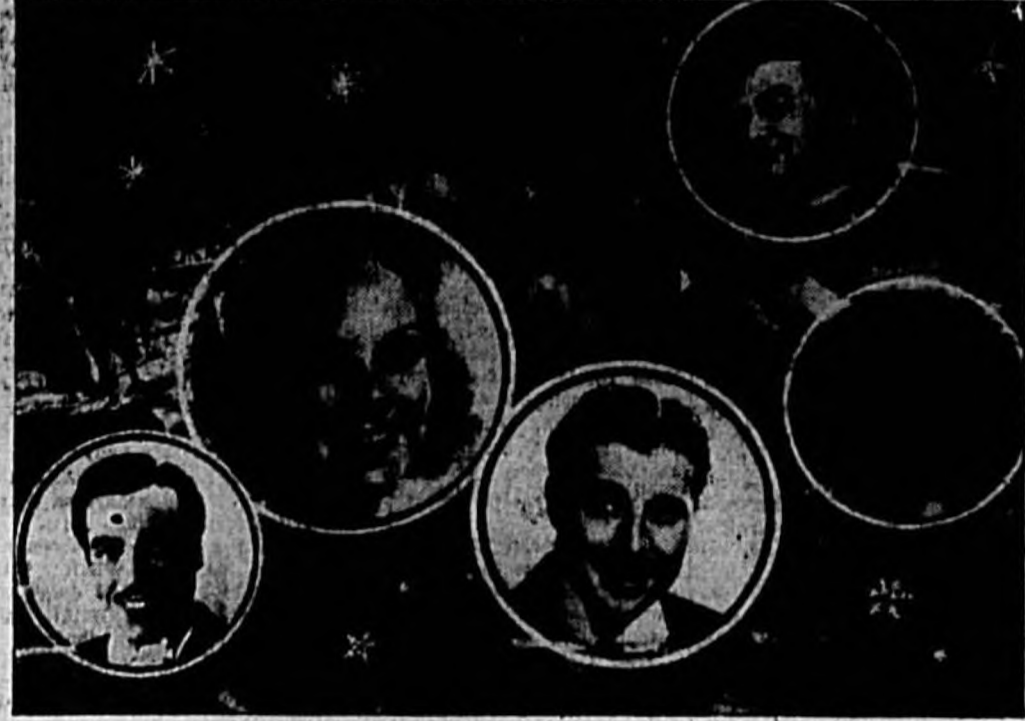
A musical of superlative splendor, wrapped in silver, ribboned with song, and happiness written all over it! Such is "Happy Landings," from Hit-Maker Darryl F. Zanuck's 20th Century-Fox studios. Sonja Henie and Don Ameche (center) are co-starred, with Jean Harsholt, Ethel Merman (right) and Cesar Romero (left) featured in the cast.