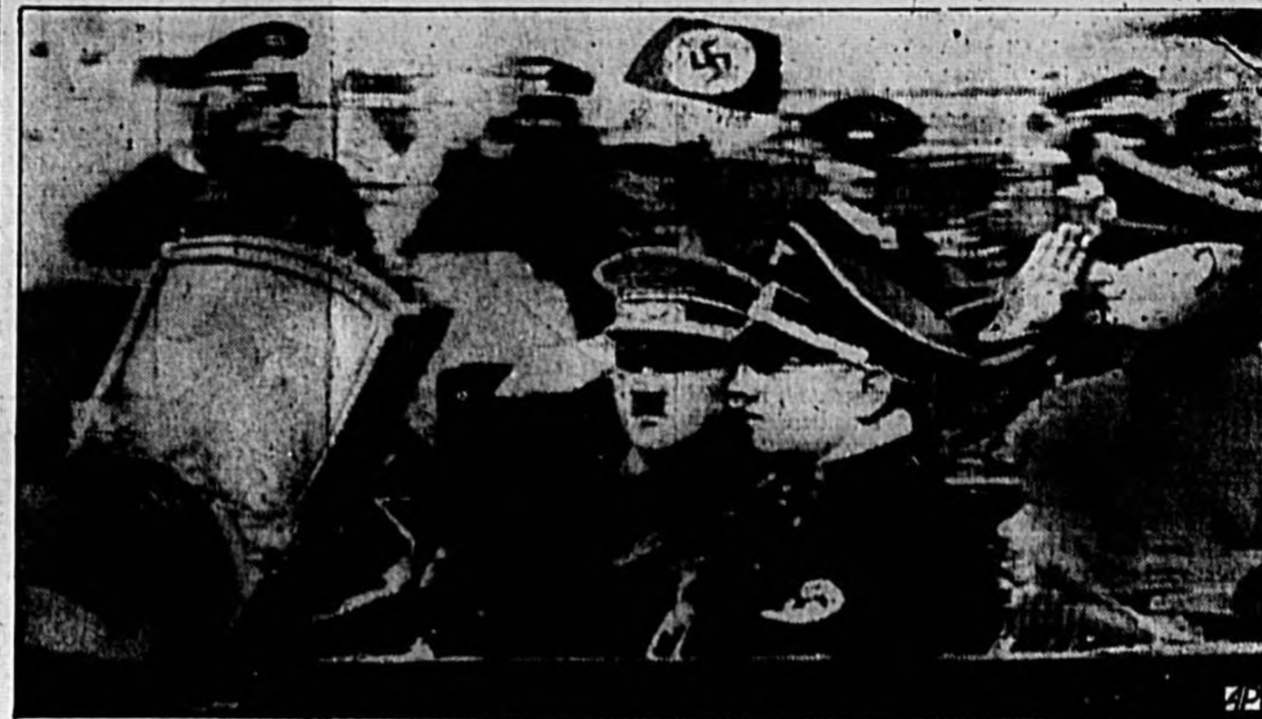
This picture, sent to New York by radio, shows Chancellor Adolf Hitler (left) as he left Munich, Germany, by auto on his triumphal entry into Austria, preceded by troops, planes and tanks. At right is Commander-in-Chief Wilhelm Keitel, in the center the chauffeur, while in the background the swastika emblem adorns the plane in which Hitler flew to Munich from Berlin.

HITLER LEAVES MUNICH TO FOLLOW TROOPS INTO AUSTRIA