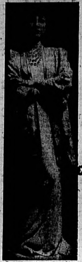
Exotic Anna May Wong will be seen as the power behind the throne in city politics in "Dangerous to Know," the new Paramount drama of a boss-ruled municipality coming next Thursday and Friday to the Ritz Theatre. Sharing the spotlight with the Chinese star in the picture are Gail Patrick, Akim Tamiroff and Lloyd Nolan.