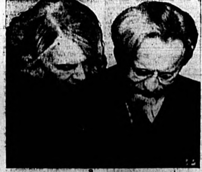
NAME OF LEON TROTSKY , former war commander who, banished in 1929, is now in Mexico where he's shown with his wife, is frequently heard at Moscow treason trial. Rosenbergs, one defendant, said Trotsky received almost a million for anti-soviet plotting.