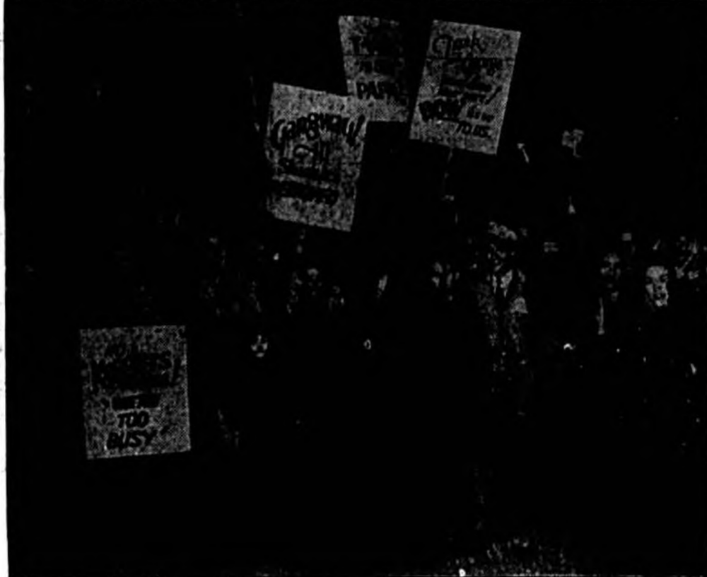
Carrying torchlights and placards in praise of President Roosevelt and Senator George W. Norris of Nebraska, citizens of the Muscle Shoals district cut loose with an unrestrained celebration in the streets of Florence, Ala., after the Supreme Court upheld the Tennessee Valley Authority. The President and Senator Norris were chief advocates in creation of the TVA.