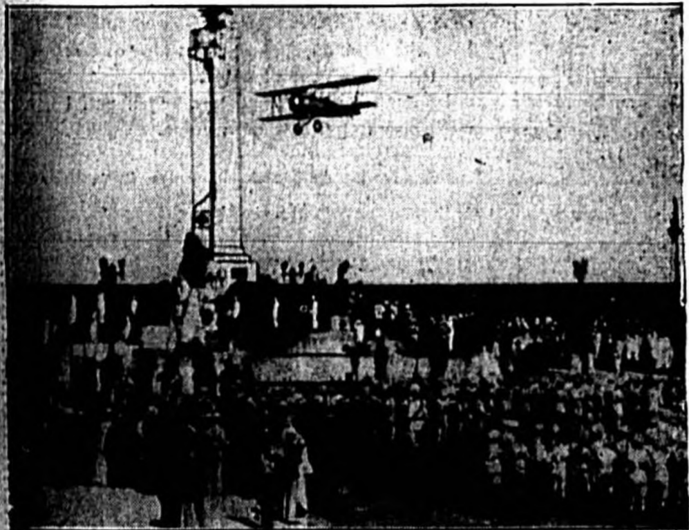
Thousands of Cubans and many Americans met on the Havana waterfront and joined in memorial services on the 38th anniversary of the sinking of the U.S.S. Maine during the Spanish-American war. A Cuban plane is shown scattering flowers on the harbor as the crowd stood around the Maine monument.