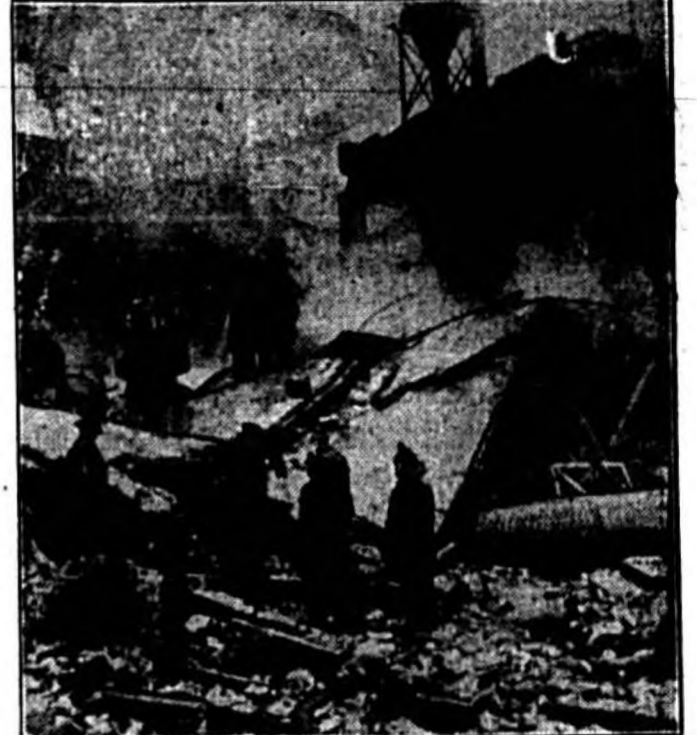
Two workmen were killed and half a dozen persons were injured seriously by an explosion that demolished the hydrogen plant of Swift and company in the Chicago stockyards. Firemen are shown searching the smoking ruins for victims.