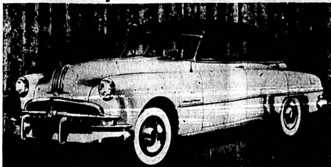
The Pontiac Chieftain line of which the four-door deluxe sedan is shown here has a 120 inch wheelbase. Roof lines have been lowered without sacrifice of comfort.