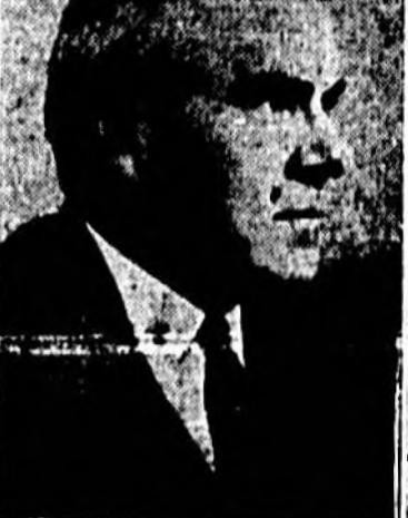
John J. McCloy, president of the World Bank, will be heard at Stetson University Wednesday, Thursday and Friday at 8:00 P. M. on world finance, past present and future. The lectures are free. The gift of Charles E. Merrill of New York.