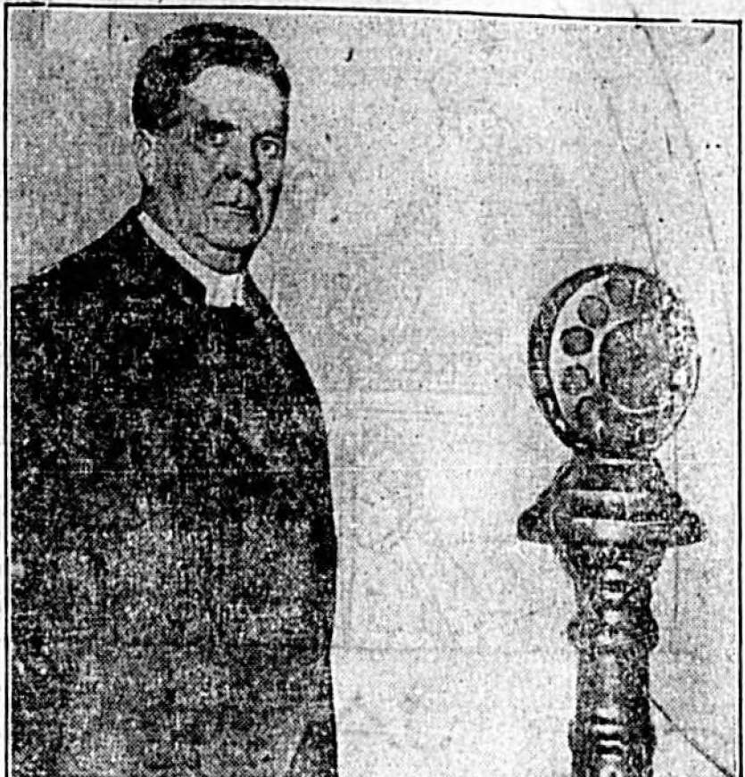
DR. S. PARKES CADMAN President Federal Council of Churches, whose Y. M. C. A. addresses on Sunday afternoons are heard by hundreds of thousands.

Millions of Americans of every sort will be upraised and blessed by the outcome of the conventions to which I refer. In a remarkable tribute to the Y. M. C. A. he said: "We are not to allow our sense of lasting obligation to this tremendous agency for brotherhood to be dulled by usage and familiarity. The home centers of the Y. M. C. A. are in nearly every town and city; its circumference sweeps around Europe, Asia, Africa and the major islands of the seas. Its flag girdles the globe with a more spiritual meaning than that of any national ensign. It is the flag of Christ, white with His purity and red with His oblation. It tells mankind of the original Christianity which came in Him, not to be ministered unto but to minister. The multiplicity of its benefits has earned for it the support of the best citizens of all Christian lands. Closely connected with it are several kindred organizations which, to a given extent, have been promoted by its successful example. After 30 years of intimate relations with this honored association, which belongs, first, to our Lord, and then to all for whom He died, permit me to wish it God-speed and every possible attainment in grace, gifts and fruit."