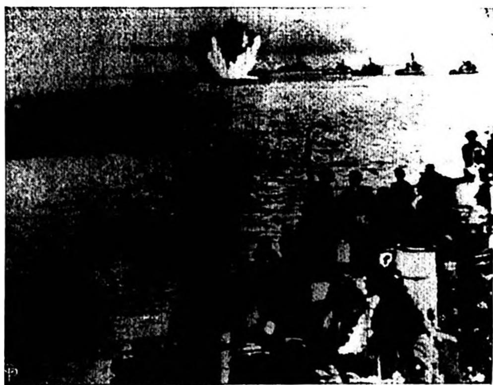
AN AXIS ROCKET HOMB that missed the mark exploded behind the Italian coast today, and other craft loaded with bombs, according to U. S. Signal Corps Radiophoto. (International Photograph)

Yanks Push On To Italy Under Enemy Bombs