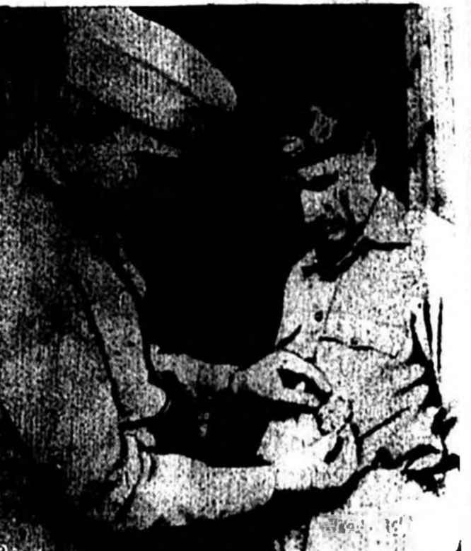
IN RECOGNITION of "extraordinary fidelity and essential services," Gen. Eisenhower pins the Legion of Merit on the shoulder of Gen. Montgomery, chief of Britain's Eighth Army...