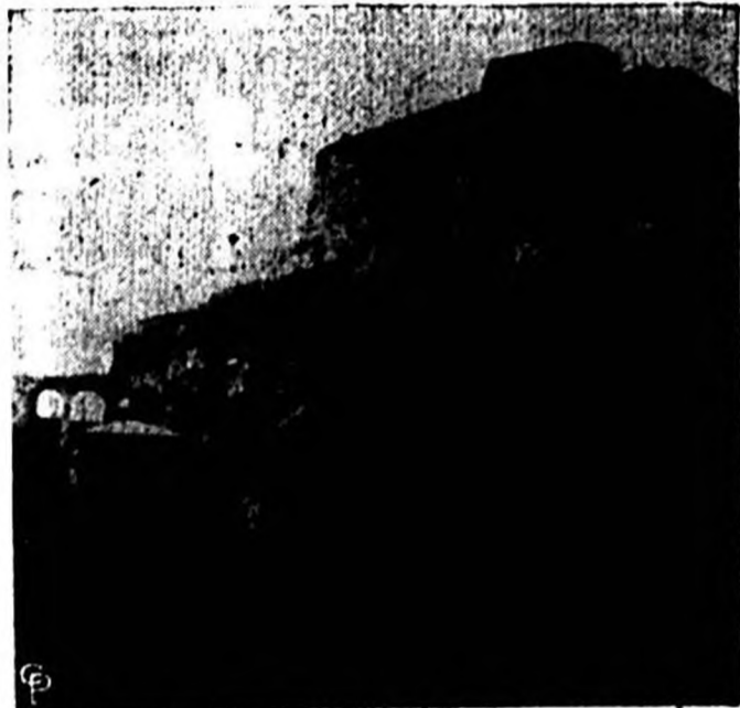
This fort high on a promontory at Scilla, Italy, is one of the points attacked and taken by invading Allied forces, according to the Berlin radio. Jutting into the Straits of Messina, it was a likely target for pre-invasion hammering by Allied bombers.