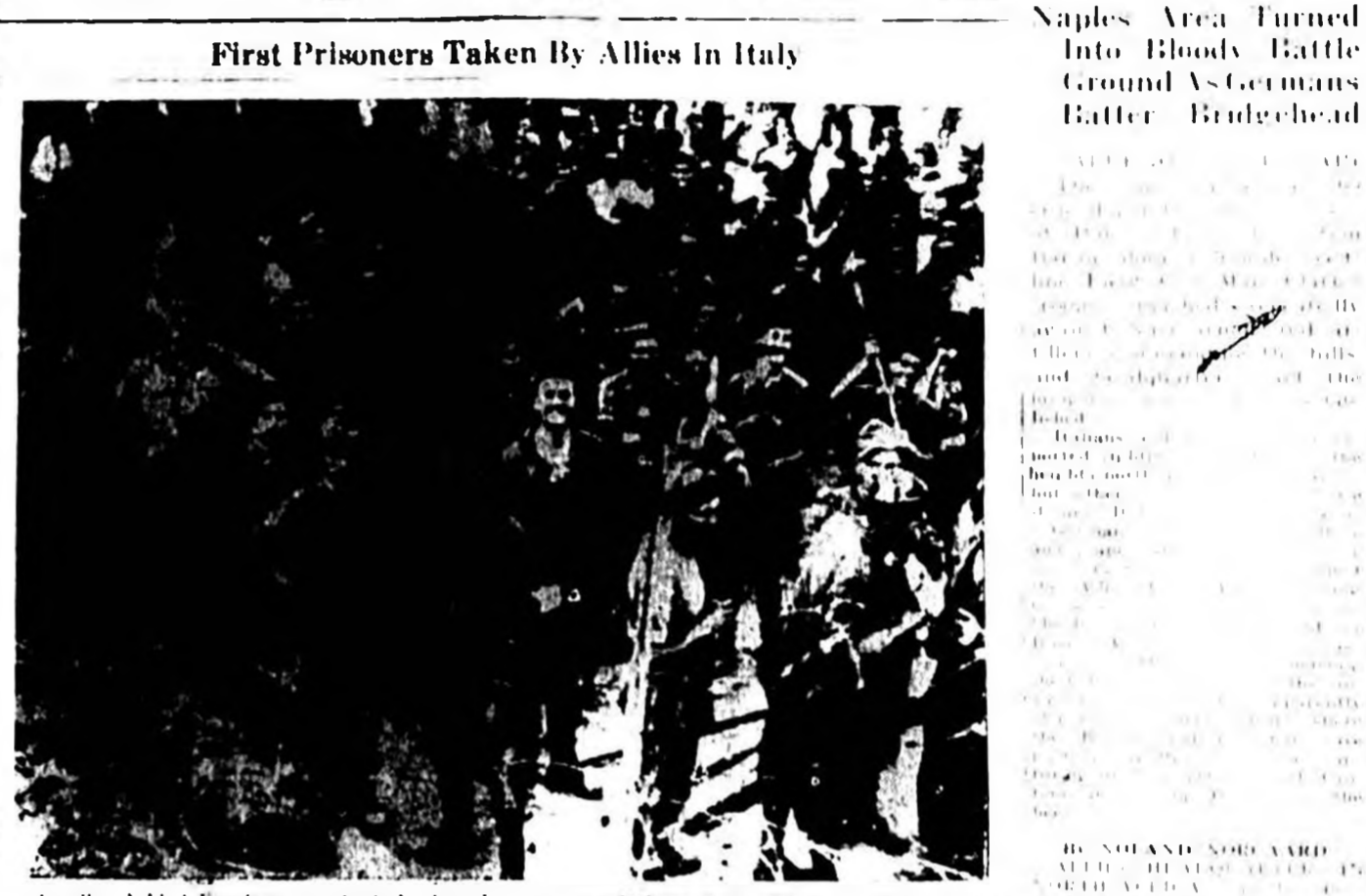
Standing behind loosely strung barbed wire, three enemy Italians were among the first prisoners taken by the invading Allied forces...