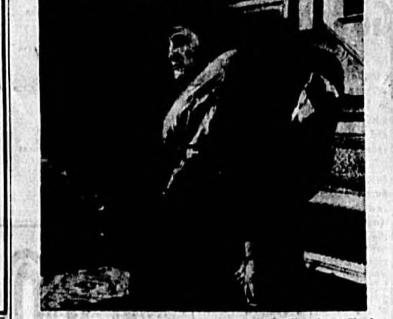
KIRK DOUGLAS is bent on revenge in "The Last Train From Gun Hill," in which he co-stars with Anthony Quinn. It starts at the Ritz Sunday.

The Movieland Drive-In Theatre will feature "Tarzan's Greatest Adventure" Sun., Mon. and Tues. starring Gordon Scott and filmed in color in Equatorial Africa. Along with the Tarzan movie will be "Tunnel of Love," a comedy about love in suburbia, starring Doris Day, Richard Widmark and Gig Young. On the bill for Wed., Thurs. and Fri. is "The Mysterians" the story of a race of gigantic scientific intellects from another planet who are determined to take over earth. This film, starring Kenji Sahara and Yumi Shirakawa, is a Toho production. The second feature is the Hitchcock thriller, "Vertigo," filmed in color in San Francisco and starring James Stewart and Kim Novak. A four-feature "Laff-A-Thon" is slated for Sat., with "Up Frog" with Tom Ewell, "Bowery Battalion" with the Bowery Boys, "Wac from Walla Walla" with Judy Canova and "Iron Petticoat" with Bob Hope.