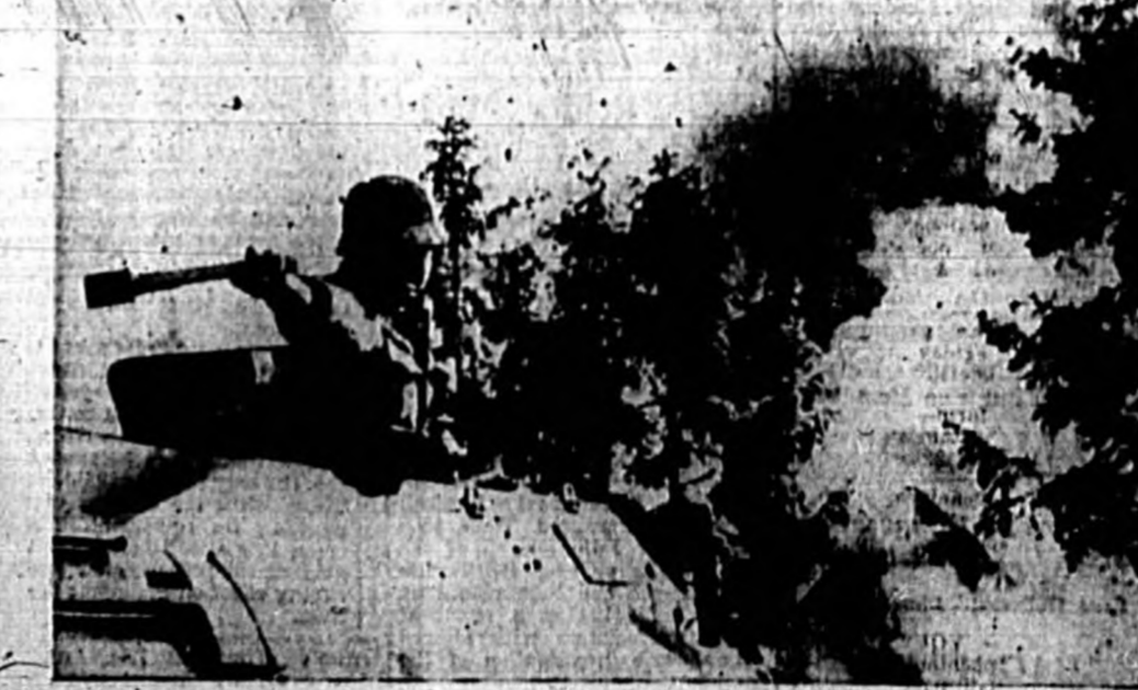
A German soldier pops up through the turret of his tank and hurls a hand grenade toward a Russian Army outpost, according to the Nazi censor-approved caption. Name of the town in Russia was not given.