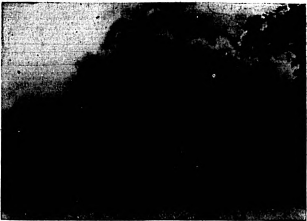
This photo, released by the German censor, is described as an oil tank burning after a German bombardment of a Soviet town. The German caption says the action occurred in a Soviet town, but the word "Shell" on the side of the building seems out of place, as the Shell Company is Dutch and all oil wells, refineries and storage tanks in Russia are the property of the Soviet government.