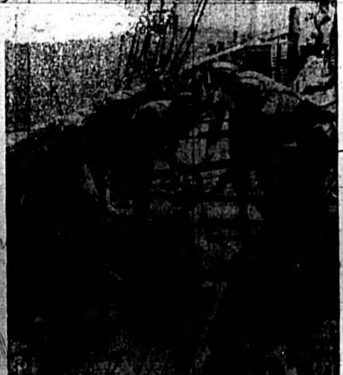
Drizzling down the deck is fun instead of work as fourteen Girl Scout Harbors from Maplewood, N. J., set sail from City Island, N. Y., aboard the famed round-the-world ship, Yorktown, for a week's cruise on Long Island Sound.