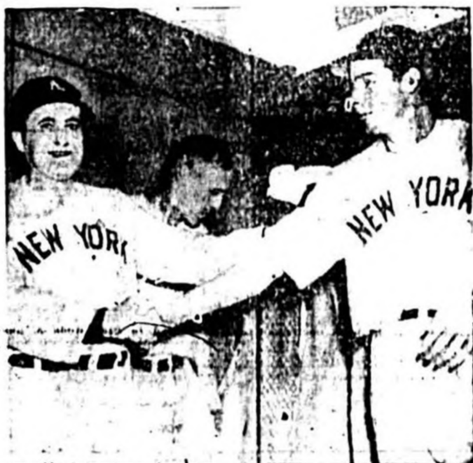
Yankee Manager Joe McCarthy congratulates Joe DiMaggio on his record-breaking feat of hitting safely in 42 consecutive games, eclipsing the mark of 41 straight set by George Sider in 1922. DiMaggio (right) made at least one hit in every game since May 12. He broke the record as the Yanks beat the Senators 2-1, 7-6 in Washington.