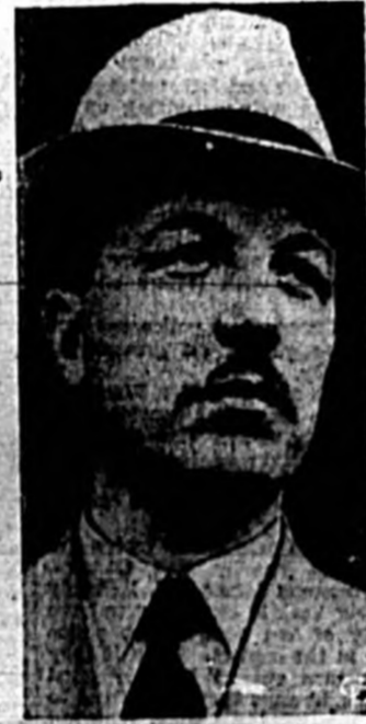
President Risto Rytö of Finland has called upon his nation to fight for the "freedom of our country." Rytö declared his countrymen were determined to fight to the last breath against the Soviet invaders.