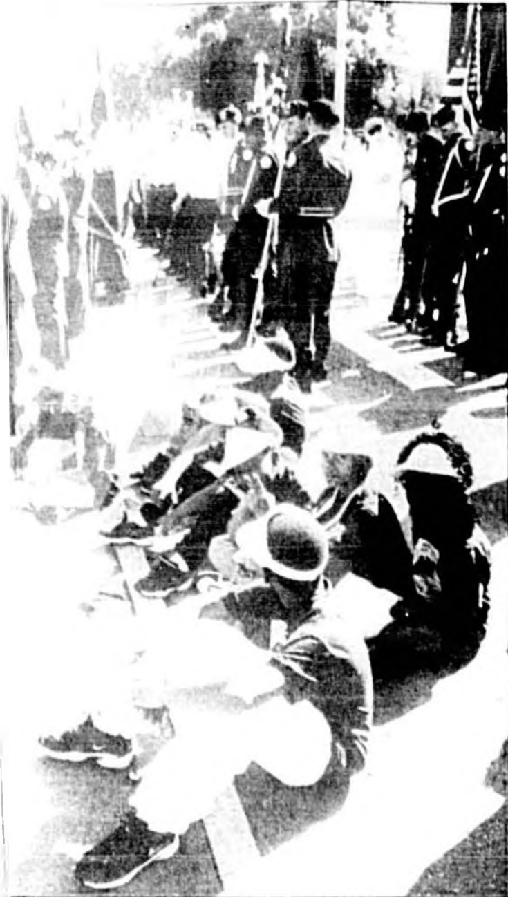
The 1997 Veterans Day parade made its way along the lakefront in Sanford as patriotic youngsters watched. Area veterans' groups and JROTC members from local high schools participated, as did the sheriff's Honor Guard and National Guard Co B 2nd Battalion.