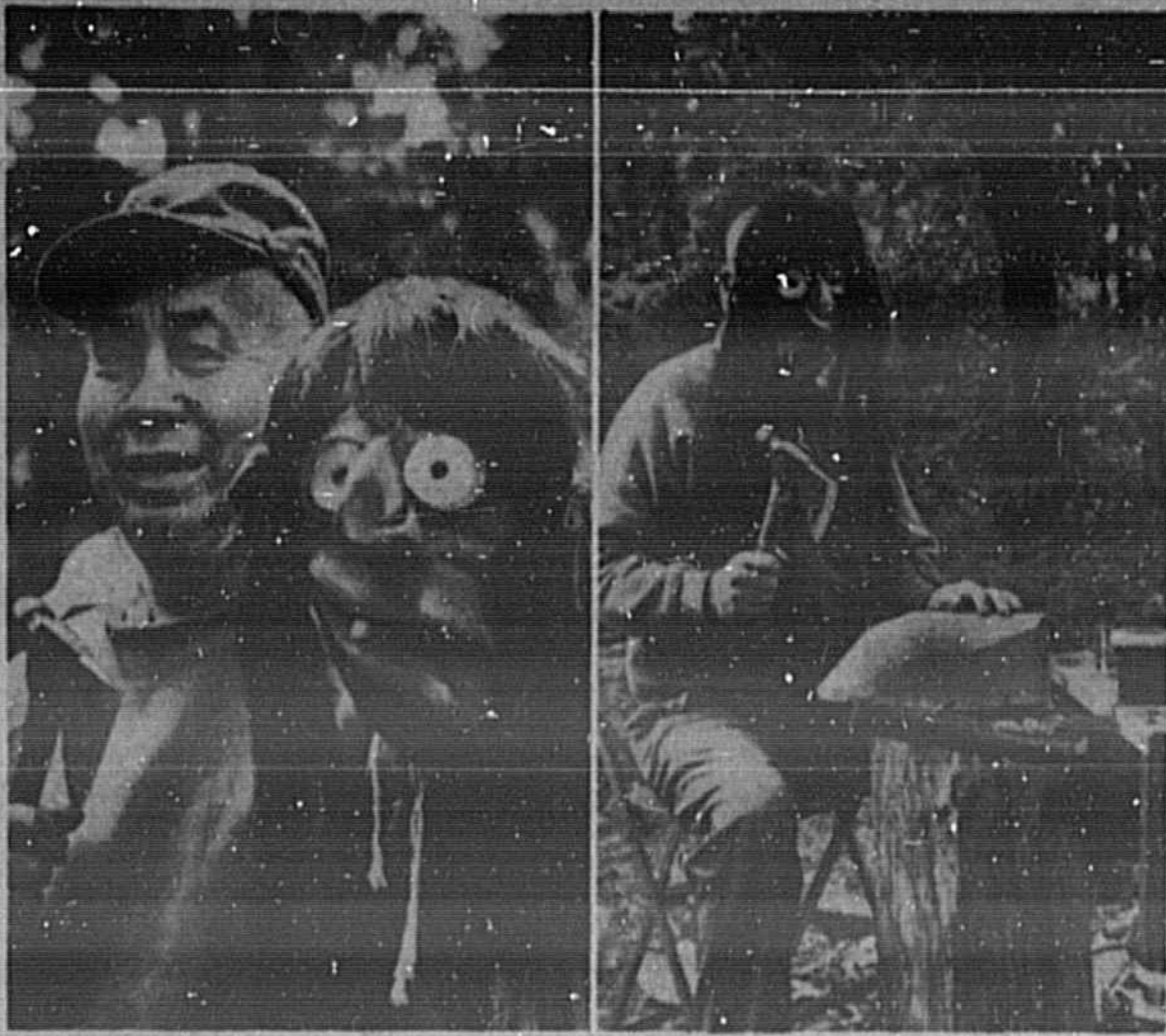
YOU NEVER KNOW what you'll run across walking in the woods these days, but you'll find it if you know where to look. Behind the fierce visage of a hunter, is a 51-year-old resident of the semipalmated reservation who pursues the ancient tribal art of mask-making. Carved from basswood, the masks take about a month to complete and bring prices up to $189 each.