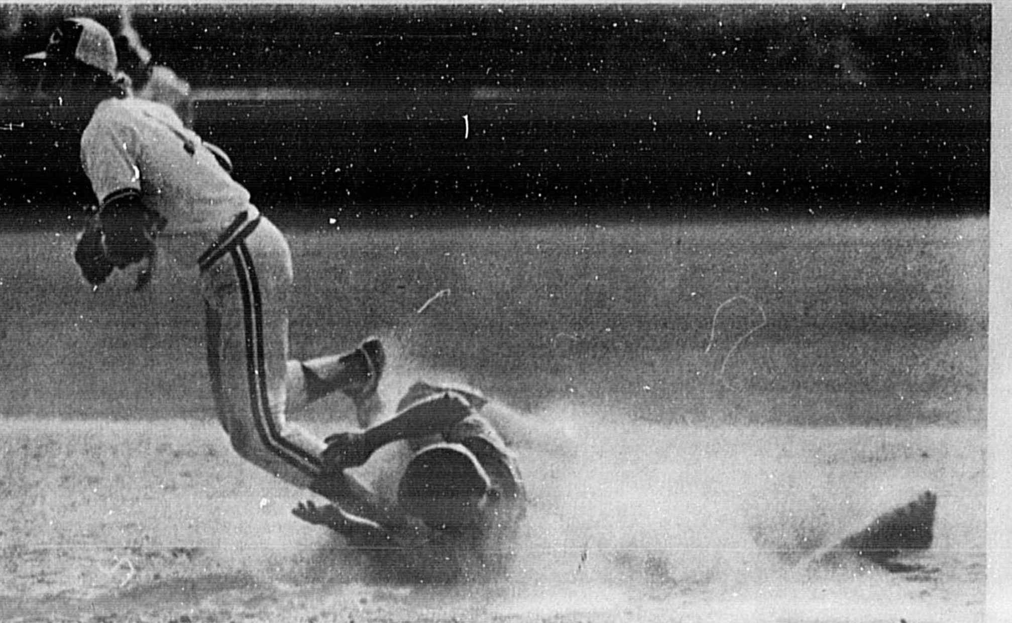
ROLLING BODY BLOCK? NO, LYMAN TITLE HOPES TAKE TUMBLE Above, the Houde takes another "tumble," but this time they came out unscathed in a 7-3 semi-final win over Orlando Colonial.