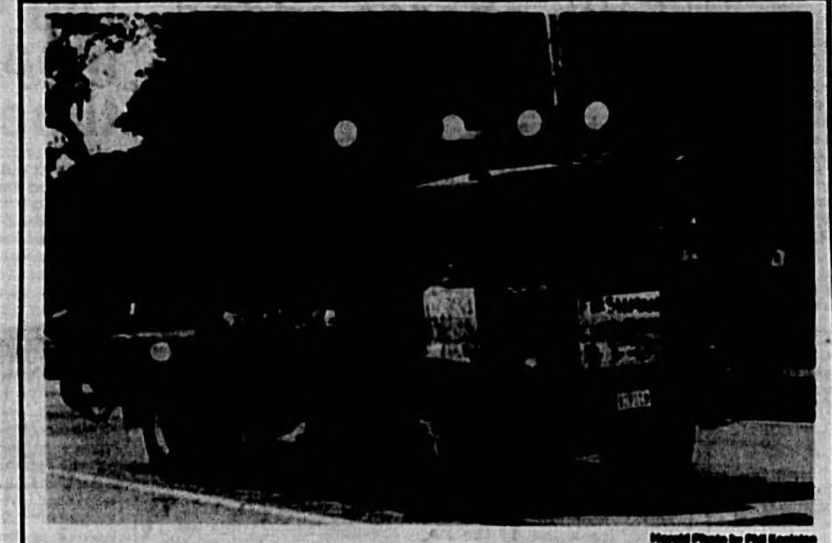
The freshman cheerleaders at Lake Mary High School were the most boisterous participants in the school's homecoming parade and were given the Most Spirited award for their efforts.