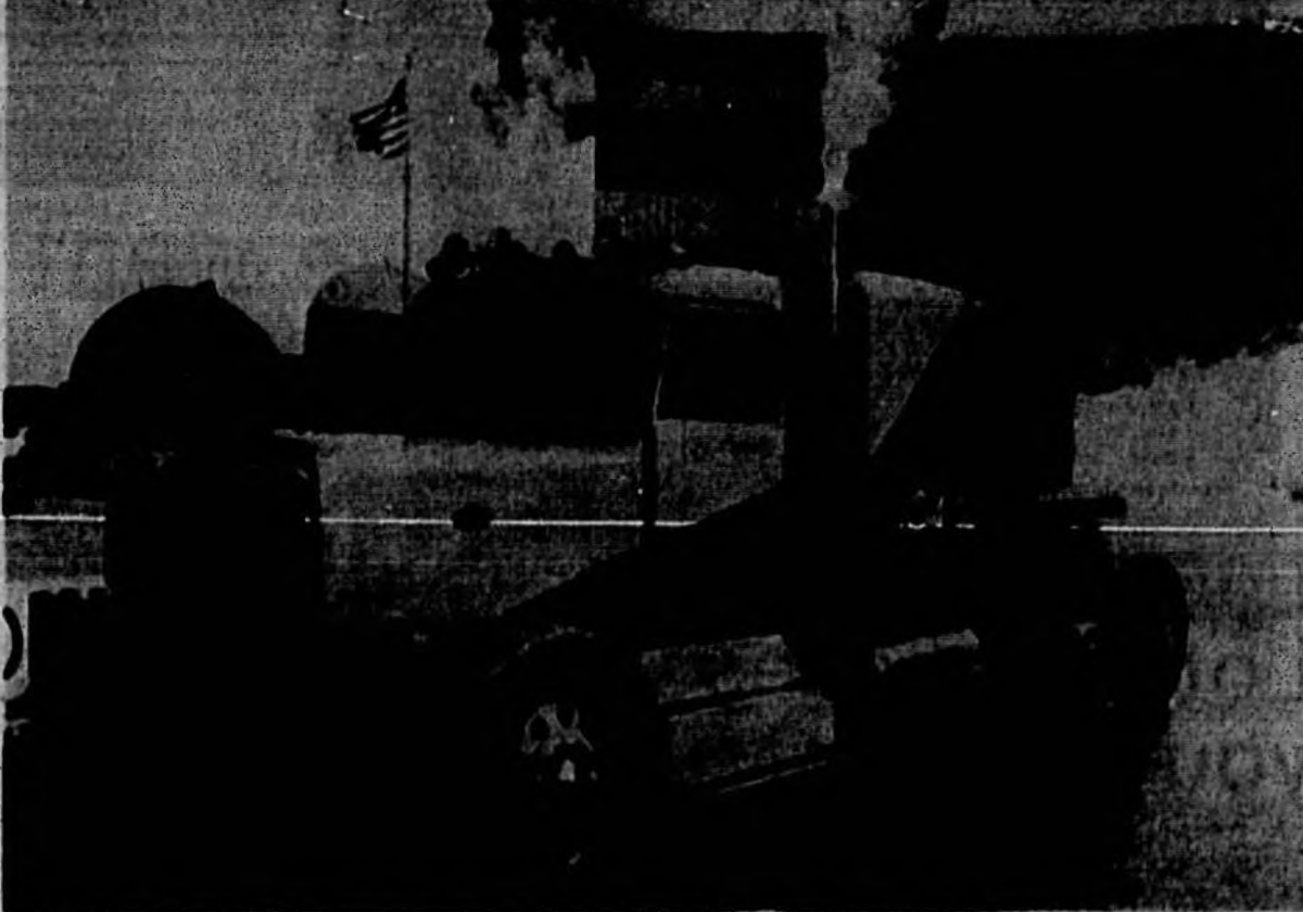
The Guinness Book of Records lists this Octane Boost Shockwave Jet Truck as the world's fastest. The speed was clocked at 376 miles per hour. The vehicle will be in Sanford Oct. 29 and 30, during Air Show Orlando, at the Central Florida Regional Airport.

The vehicle is valued at a half million dollars.