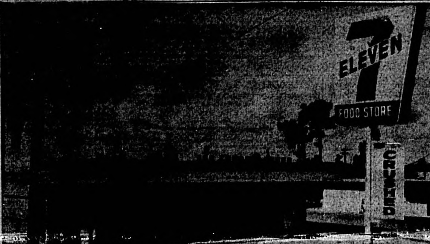
THIS IS IT. The new handy convenient 7-11 food store on the corner of Country Club Rd. and Hardy Road which is holding Grand Opening Friday and Saturday.