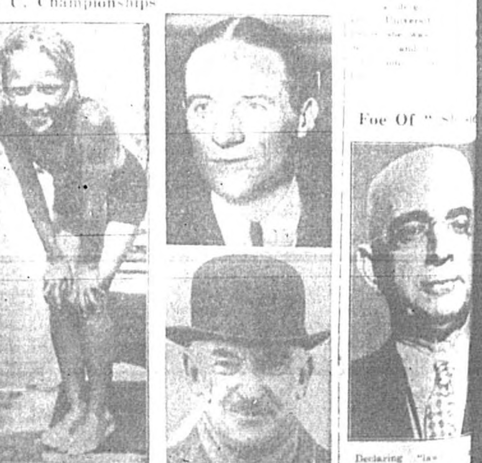
Baby deer wins A. A. U. championships. The child in the picture is the winner.

Mobile County Produces And Vegetables Than Any Other Area in America