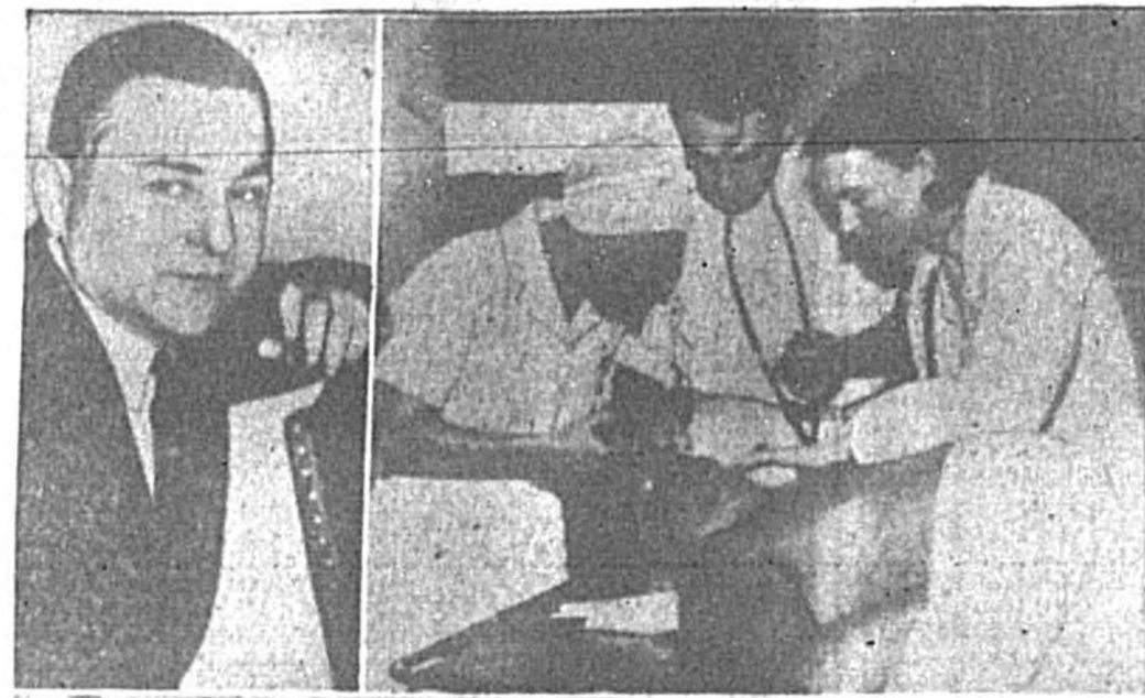
The 'big shot' gangster, who was slain from an ambush, is shown in this picture. He was a prominent figure in the underworld.