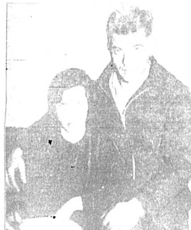
The need for travel is emphasized in this picture. It shows a family enjoying a day out.