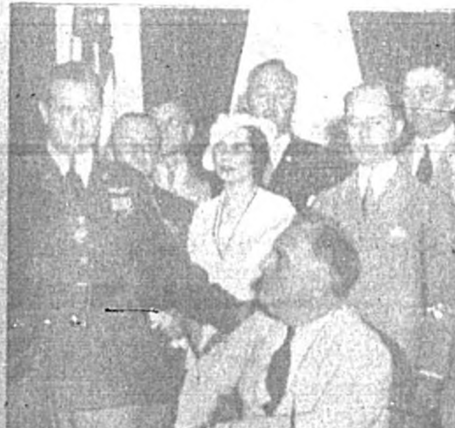
Pioneering fur is rewarded. The man in the picture is being honored for his contributions.