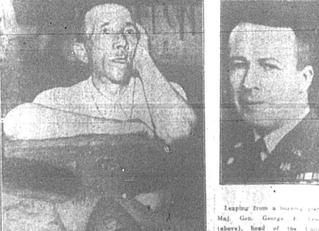
Saved by leap. The man in the picture is shown in a dramatic moment.