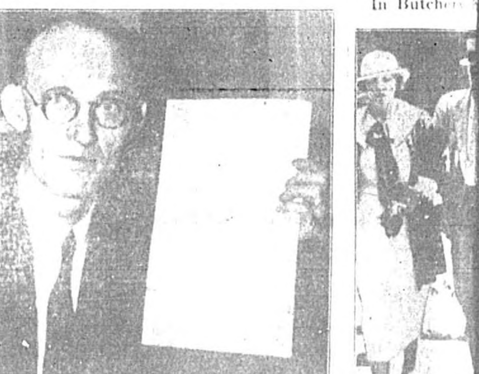
Deen loses adjournment fight. The scene is shown in this picture.