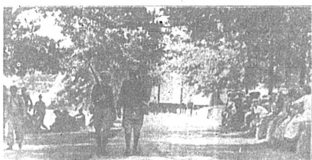
Strike brings troops to the Carolina mill. The scene is shown in this picture.