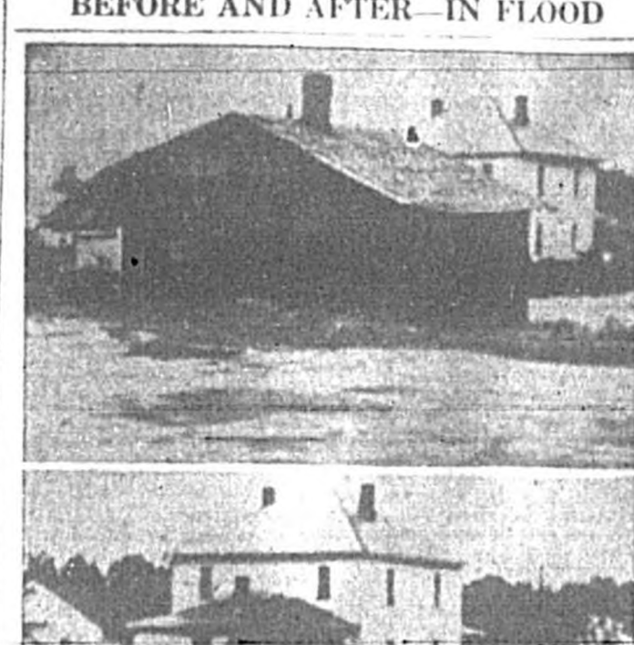
Before and after in flood. The area is shown in this picture.