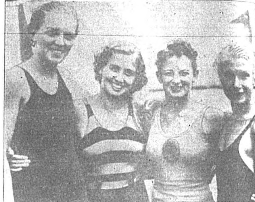
Swimming queens in the A. A. U. championships are shown in this picture. They are competing for the title of national champion.