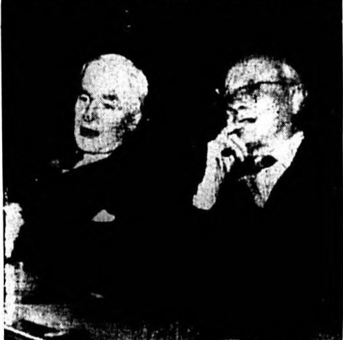
Secretary of State Cordell Hull, left, and former Republican presidential candidate Alfred Lunt, United States delegate to the Pan American conference in Lima, are pictured in conversation.