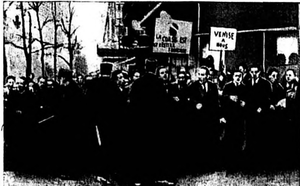
TRICKED BY Italy's colonial demands, thousands of Parisian students demonstrated in the Latin quarter as shown in the radiophoto. They carried signs which denounced Rome's claims, and demanded that Venice and Yugoslavia be given to France, instead.