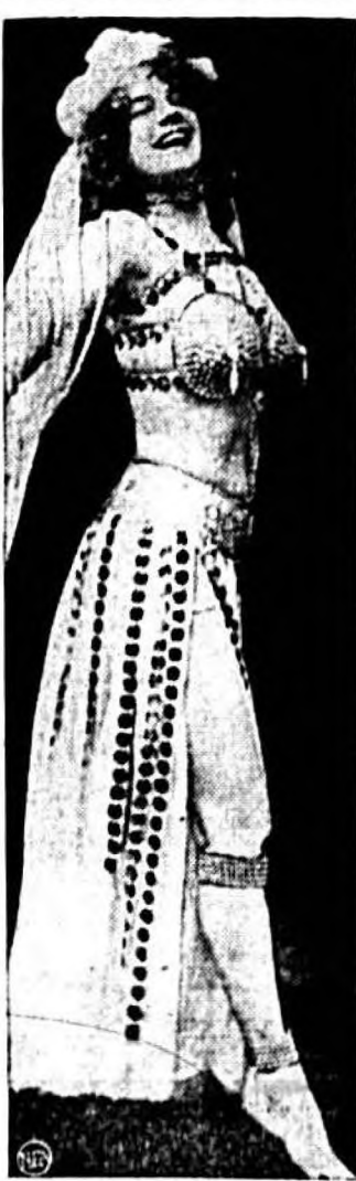
Eva Tanguay, 60, who made "Lili Care" famous, is critically ill in Hollywood. This old-time picture shows her at the height of her stage popularity.

If your family is against leftovers try mixing them with other foods. Or never serve any warmed over food the day following its first appearance. Wait at least a day; the chances are the family will forget it is a leftover.