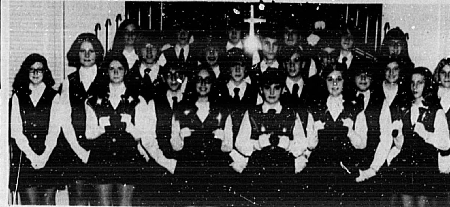
Graceham Moravian Church Hand Bell Ringers will present concert for Winter Springs Redeemer Moravian.

SEMINOLE COUNTY AREA CHURCH DIRECTORY List of churches and their addresses in the Sanford area.