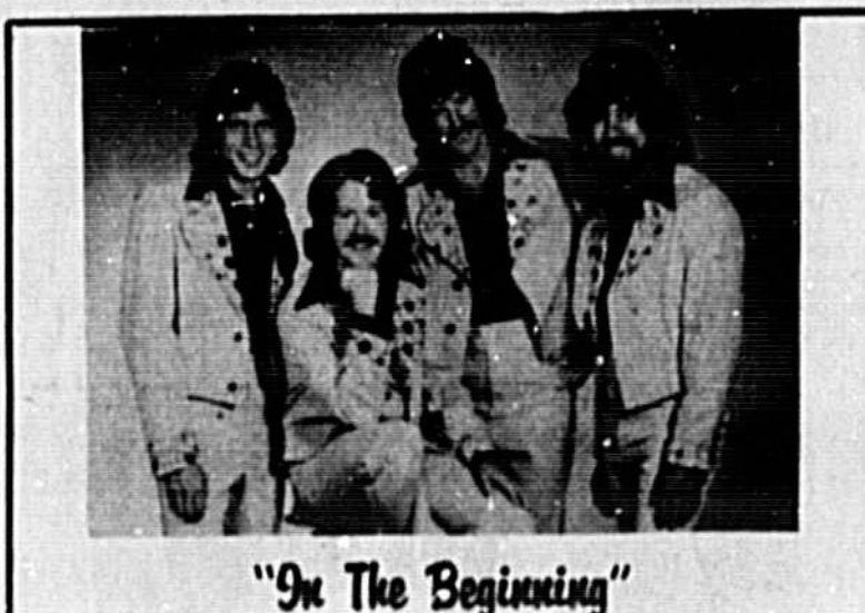
"On The Beginning" Back At The Lul with Popular Request...