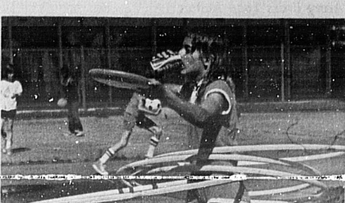
Lots of people have trouble keeping up with two things at once, much less three...