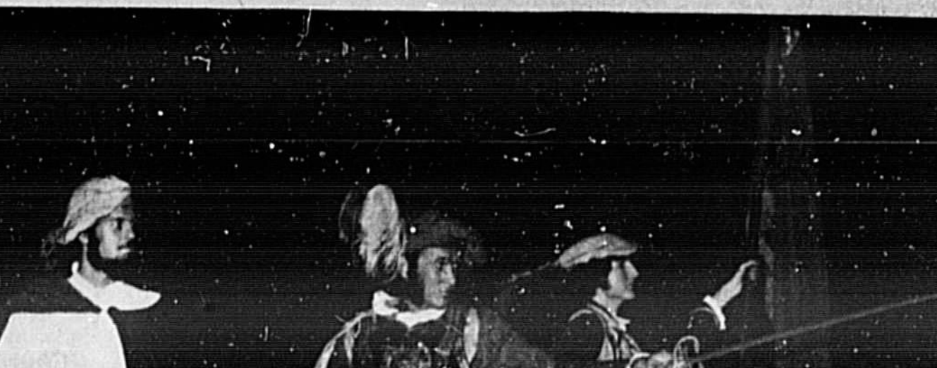
Jean Ribault (center) and his mxc face the spartans along the River Matanzas on the eve of battle.

It has not been decided, as yet, whether the city will upgrade its water plant or purchase water from Sanford or Wilco Utilities Inc, he said.