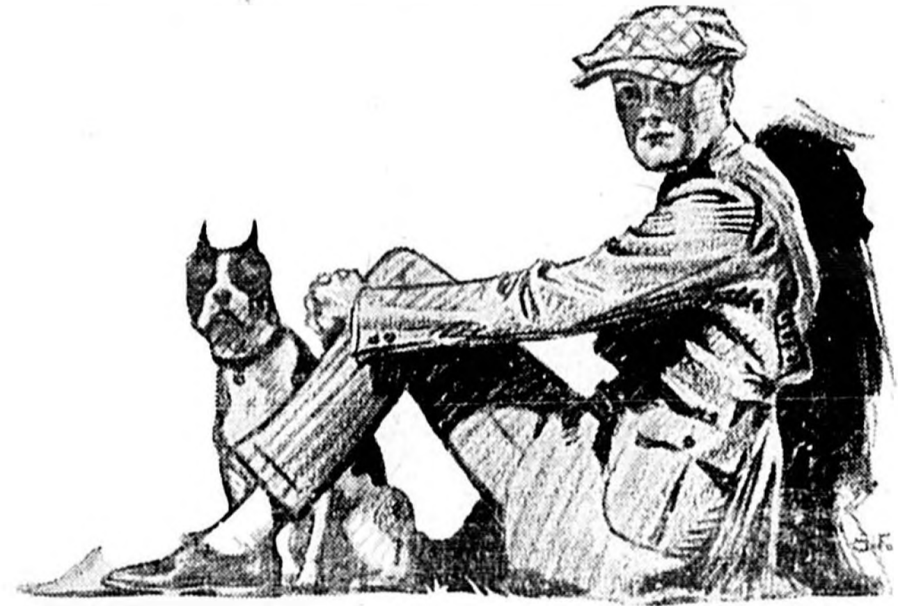
Copyright 1922 Hart Schaffner & Marx