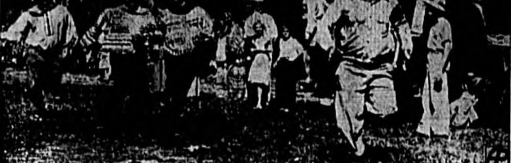
Handicapped by her long, brightly colored dress, the Indian woman in the foreground put on a burst of speed and won the sprints' footrace in the first annual Seminole athletic meet on the Glades county reservation near Brighton, Fla. Below, Seminole fat men are shown displaying their fleetness in any. The plainly dressed fellow (right) defeated his gaily garbed rivals. Five gallons of gasoline was the prize. The celebration was held in celebration of the acquisition of 35,000 acres of Everglades land for use as a cattle range by the Seminoles.