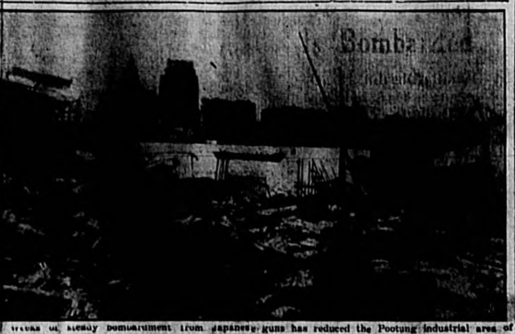
Shanghai to ruins, as this picture shows. Just across the Whangpoo river is the International Settlement which has escaped a similar fate. The building with the pointed tower is the Cathay hotel which Chinese fliers accidentally bombed early in the conflict.