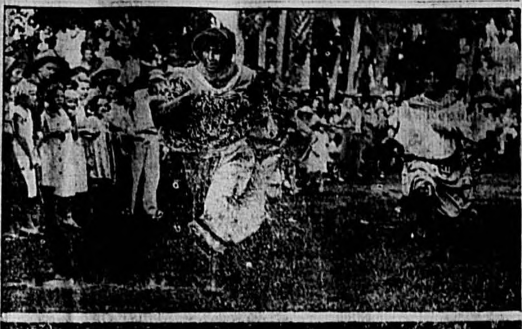
Handicapped by her long, brightly colored dress, the Indian woman in the foreground put on a burst of speed and won the sprints' footrace in the first annual Seminole athletic meet on the Glades county reservation near Brighton, Fla. Below, Seminole fat men are shown displaying their fleetness in any. The plainly dressed fellow (right) defeated his gaily garbed rivals. Five gallons of gasoline was the prize. The celebration was held in celebration of the acquisition of 35,000 acres of Everglades land for use as a cattle range by the Seminoles.