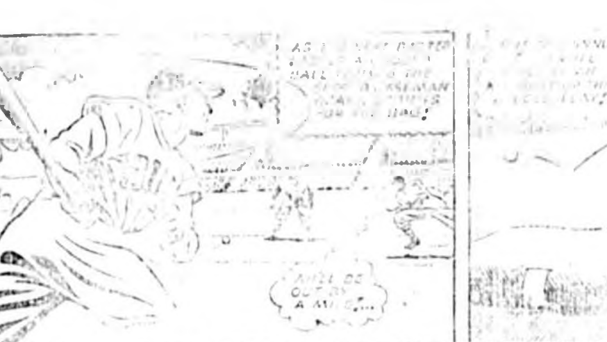
MICKEY MOUSE By Walt Disney