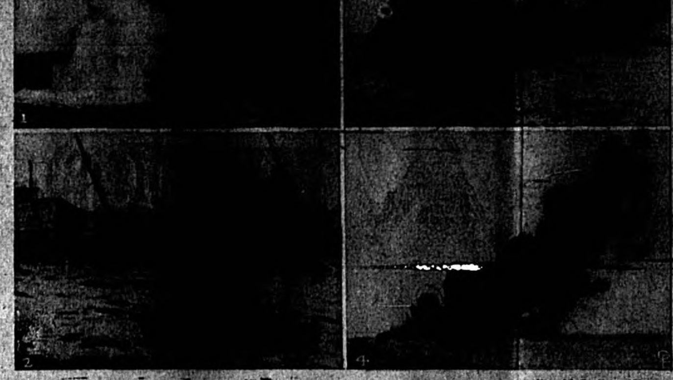
First picture to reach the United States showing Russian naval action in the Baltic Sea, these remarkable photos during the sinking of a German supply vessel by a Red torpedo. (1) Water spumes high as a Russian torpedo strikes home in the open of the Nazi ship. (2) Crew members of the sinking vessel pull away in a lifeboat as the ship starts to heel over. (3) The stricken vessel, evidently an oil tanker, starts its plunge to the bottom. (4) A mounting cloud of dense smoke hangs over the water, sole remnant of the German boat.