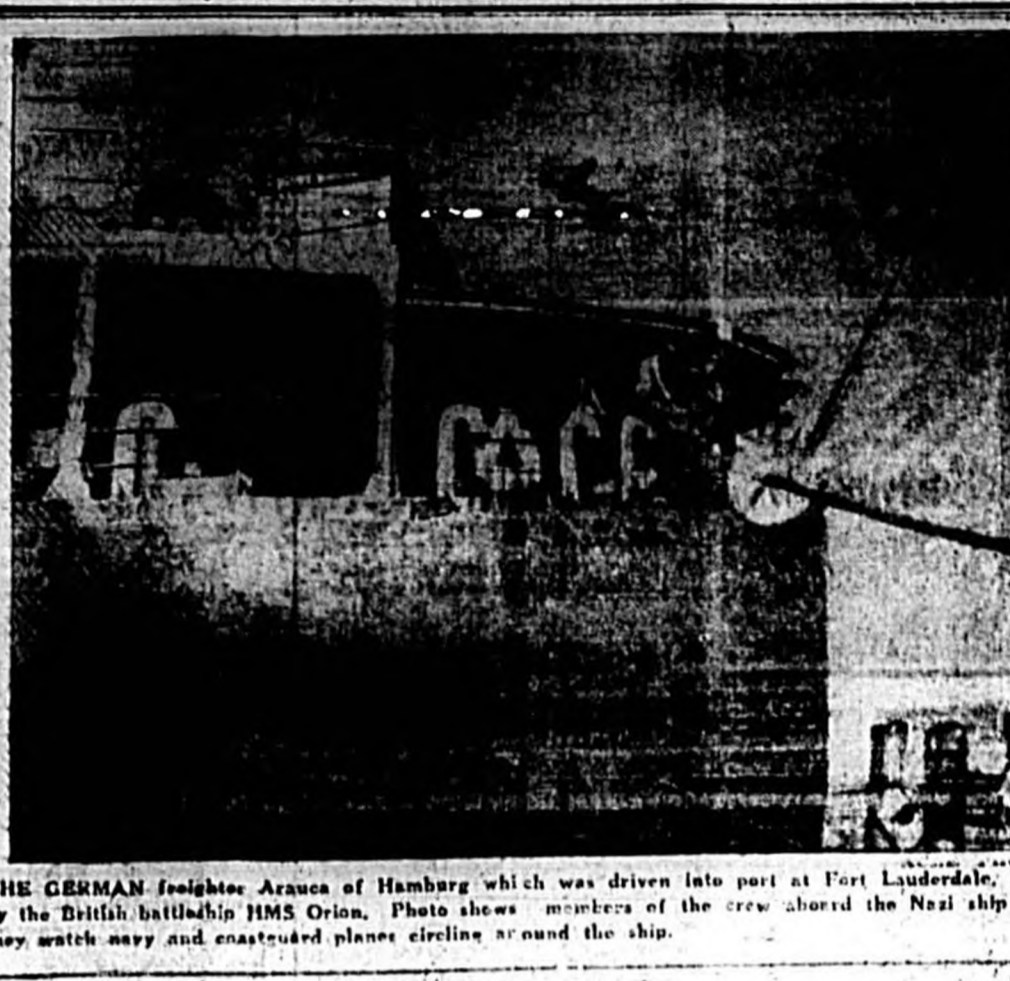
THE GERMAN fighter, Arado of Hamburg which was driven into port at Port Lauderdale, Fla. by the British battleship HMS Orion. Photo shows members of the crew aboard the ship as they watch war and captured plane circling around the ship.