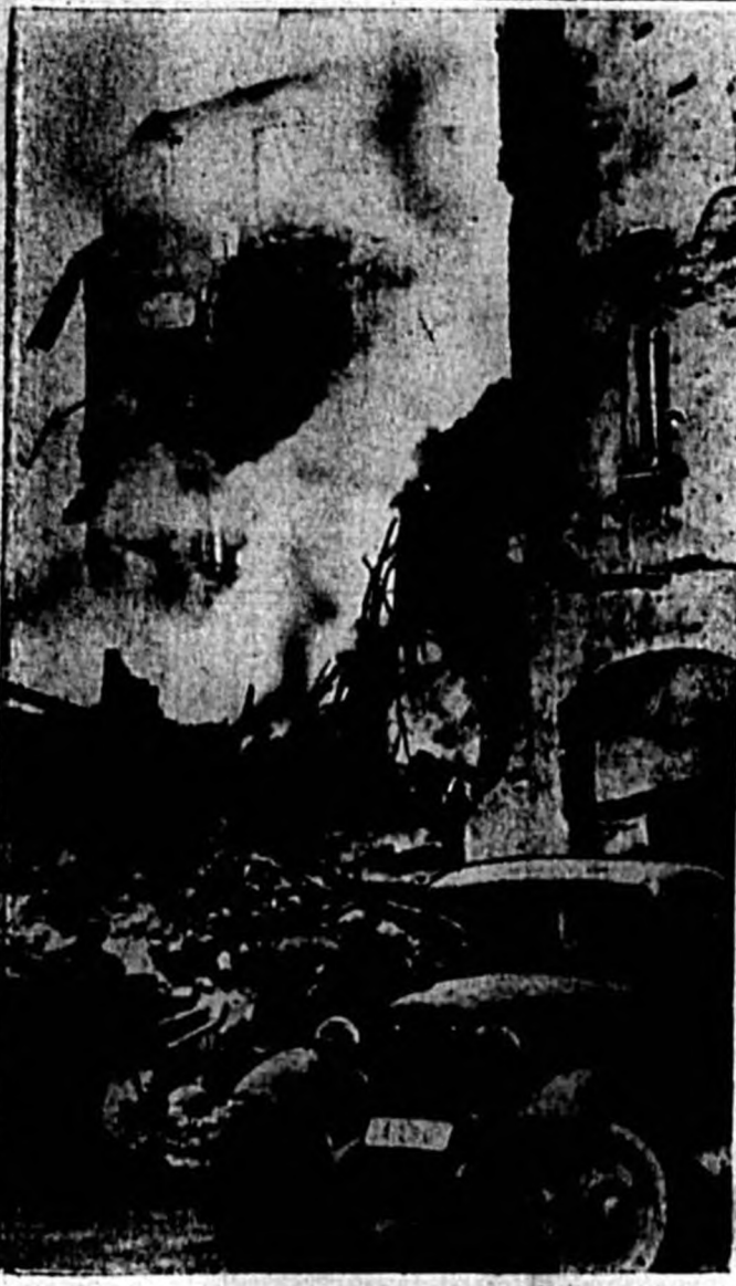
As Soviet bombers celebrated Joseph Stalin's birthday by raining death and destruction on Helsinki, this photo, graphically portraying the destructive power of aerial bombs, arrived in New York by trans-Atlantic clipper. The wrecked building was an apartment house in the Finnish capital.