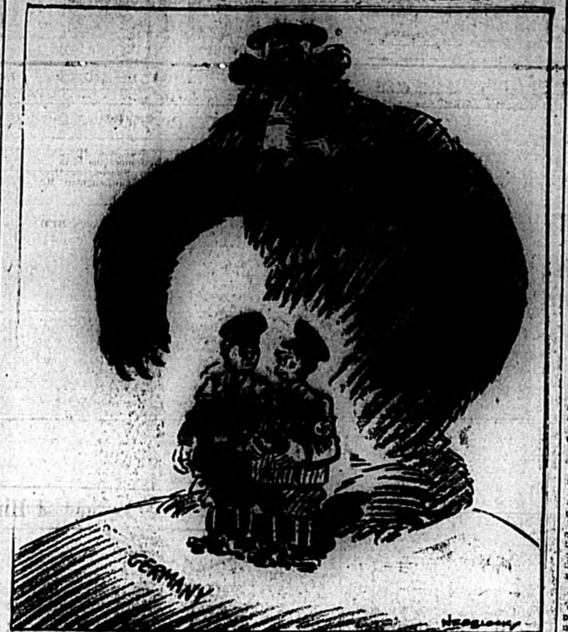
JA! BRITAIN WAS TRYING TO ENCIRCLE US