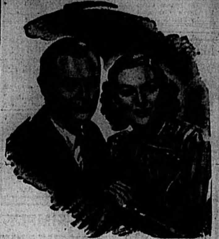
A gay, bantering tale of life under the "L" in Greenwich Village brings Robert Montgomery and Rosalind Russell to the Ritz screen Wednesday and Thursday in "Live, Love and Learn." Robert Benchley adds his special brand of humor to the amusing plot and Helen Vinson is prominently cast another of her highly-applauded "other woman" portrayals.