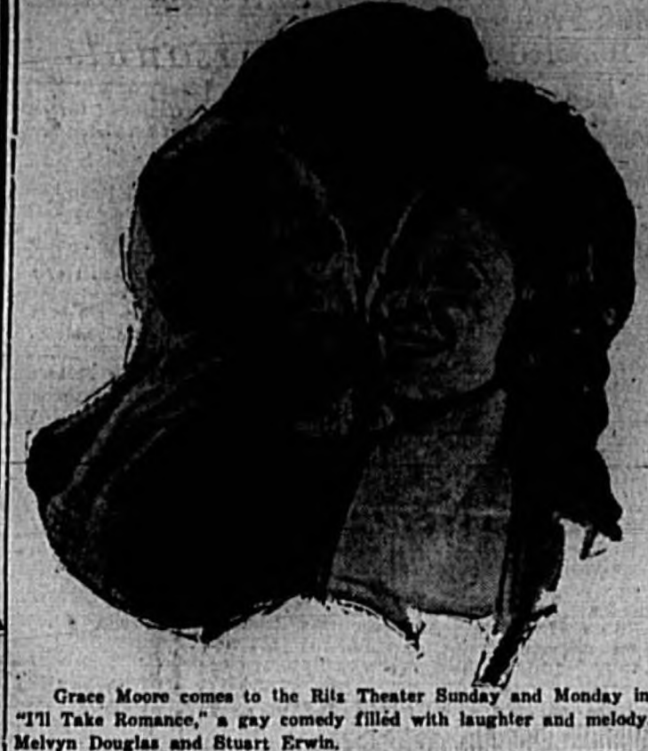
Grace Moore comes to the Ritz Theater Sunday and Monday in "I'll Take Romance," a gay comedy filled with laughter and melody. Melvyn Douglas and Stuart Erwin.