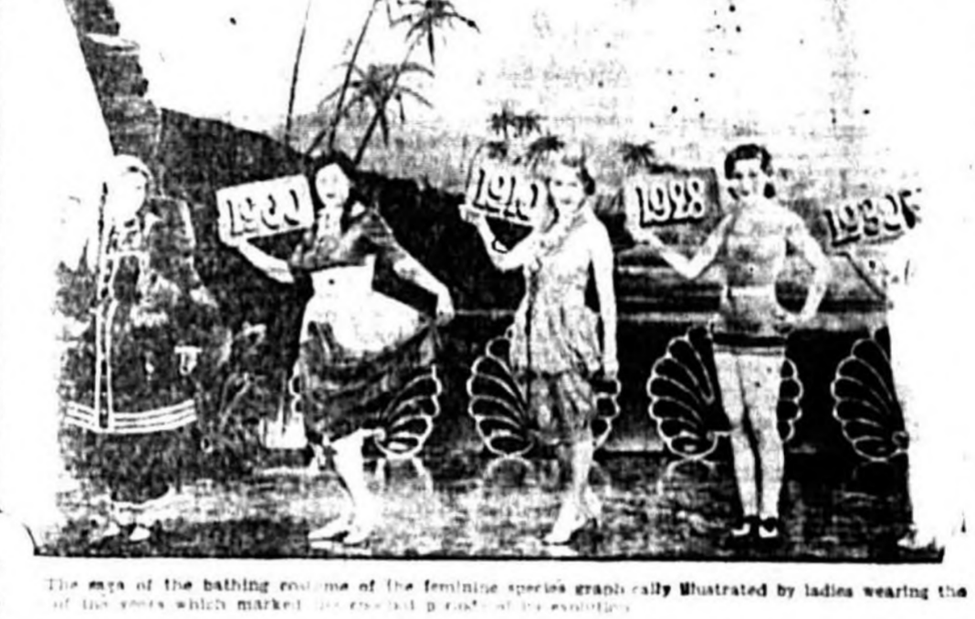
The ways of the bathing costume of the feminine species graphically illustrated by ladies wearing the costumes which marked the progress of its evolution.

FORT MYERS Local Piggly Wiggly store No. 1 is called complete meat market and enlarged bakery and grocery departments.