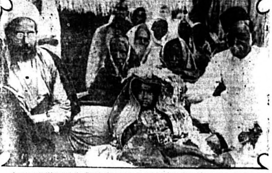
Despite everything that the British Government is and has been doing for a century to discourage the custom of child marriages in India, the age-old custom is still alive, and in the remote places of the country the marriage of girls under the age of ten is still a commonplace. This photograph shows the marriage of a seven-year-old maid.