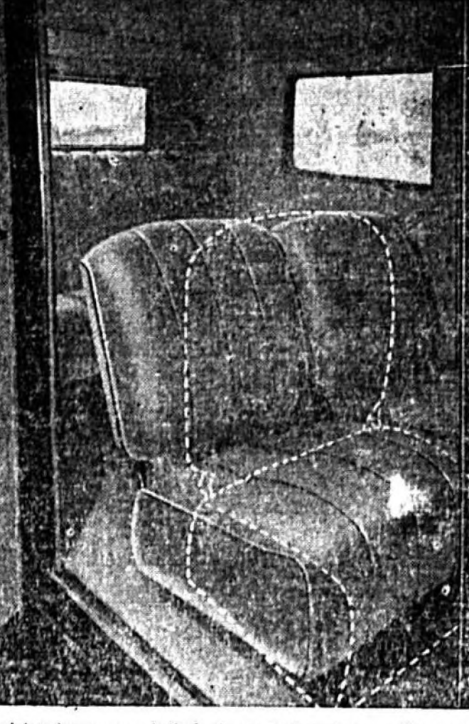
Coach interiors are now built for beauty and comfort as well as utility. Hudson and Essex are featuring large fully padded seats. The right hand seat slides forward, even with a passenger seated, so as to allow free passage through the wide door to the rear seat.