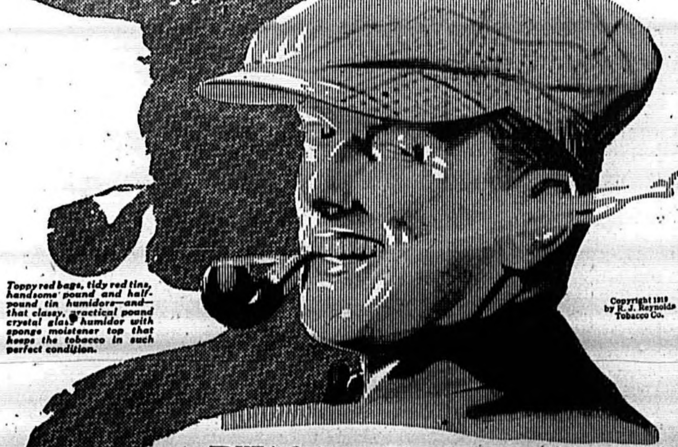
Topsy red bags, tidy red tins, handsome pound and half-pound tin humidors—and that classy, practical pound crystal glass humidor with sponge moisture top that keeps the tobacco in such perfect condition.

PUT it flush up to Prince Albert to produce more smoke happiness than you ever before collected! P. A.'s built to fit your smoke appetite like kids fit your hands! It has the jimmidiest flavor and coolness and fragrance you ever ran against!