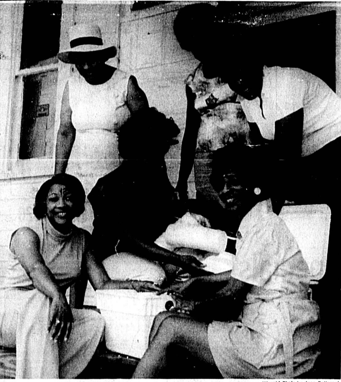
Moving Meals. Kappa Sigma Omega chapter of Alpha Kappa Alpha sorority has volunteered time this summer to help Sanford's senior citizens by delivering some 80 meals daily to persons registered with the Meals on Wheels program.