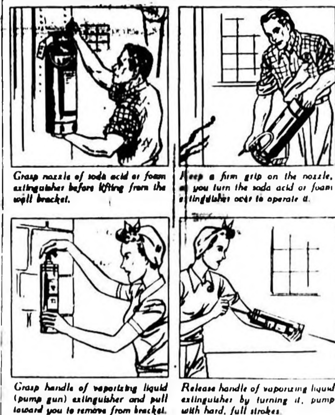
Grasp nozzle of soda acid or foam extinguisher before pulling handle. Keep a firm grip on the nozzle. Turn the nozzle acid or foam extinguisher to operate it.