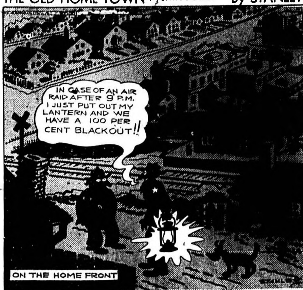
ON THE HOME FRONT