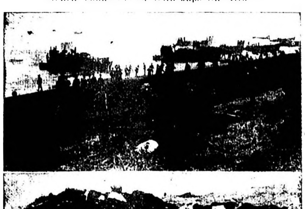
Operations on Attu Island in the Aleutians.