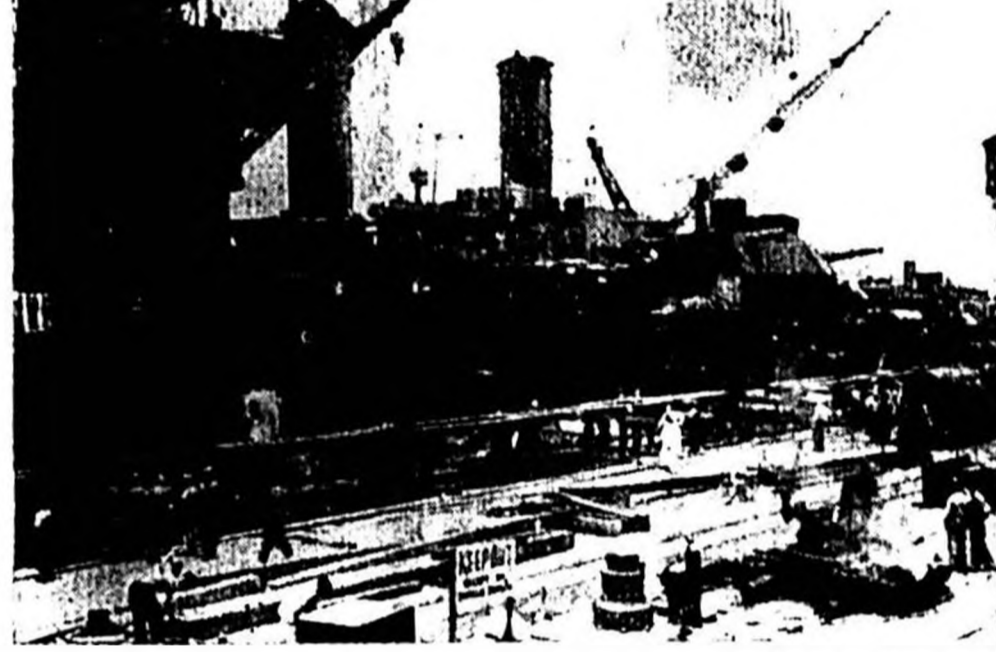
The USS West Virginia (BB-48) with other battleships of the fleet, December 2, 1941, put to rest the dead ships that were sunk in the attack on Pearl Harbor. The USS West Virginia (BB-48) was the only battleship to survive the attack on Pearl Harbor.