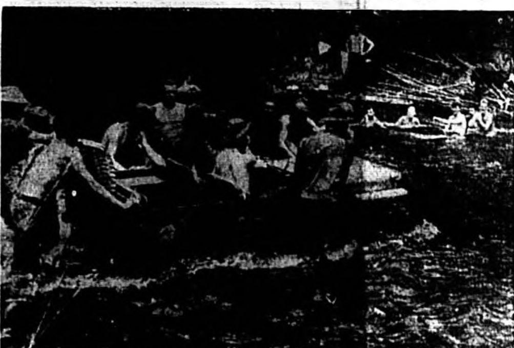
While a group of American troops (background) stationed in New Guinea splash about in a stream, some of their buddies struggle to push a log across it. These men in company with Australian soldiers, are part of the forces taking part in the battle to push the Japs back along the Buna.