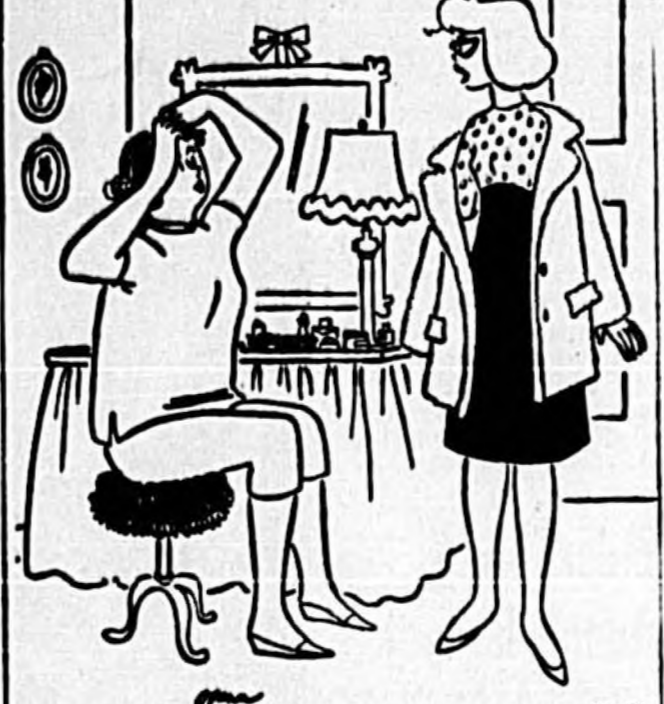
Men are all alike. They take you to a movie, buy you soda, then they expect you to help push to get their car started!