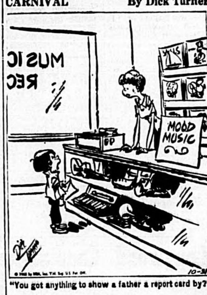
"You got anything to show a father a report card by?"