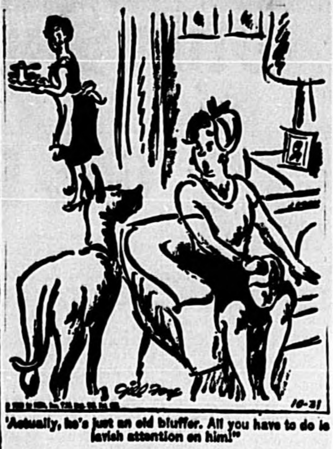
Actually, he's just an old bluffer. All you have to do is lavish attention on him!