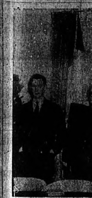
OPENING THEIR HISTORIC SESSIONS at the Waldorf-Astoria Hotel in New York, the Big Four Foreign Ministers began their conference with the problems of European treaties and the future of Germany. In this first picture is shown, left to right, French Deputy Foreign Minister Maurice Couve de Murville; British Foreign Secretary Ernest Bevin; Soviet Foreign Commissar V. M. Molotov and U. S. Secretary of State James F. Byrnes.

First Picture Of Big Four At Historic Meeting