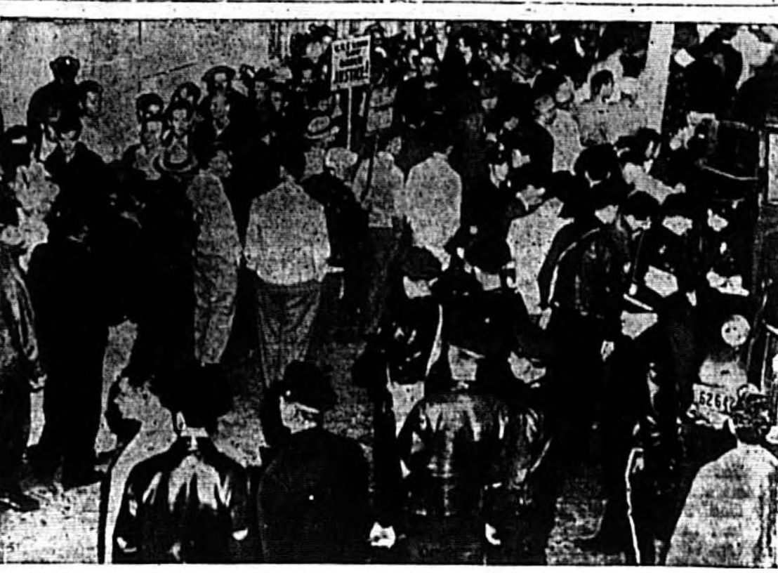
POLICE ARREST MORE THAN 250 STRIKING FILM WORKERS and load them into patrol wagons outside the Columbia Studios, in Hollywood, Calif. The pickets were charged with conspiracy to violate a court injunction limiting the number of pickets and for disturbing the peace. Meanwhile, other strikers continue to picket, at right, to the music of "Don't fence me in." The Actors Guild voted to cross the picket line.