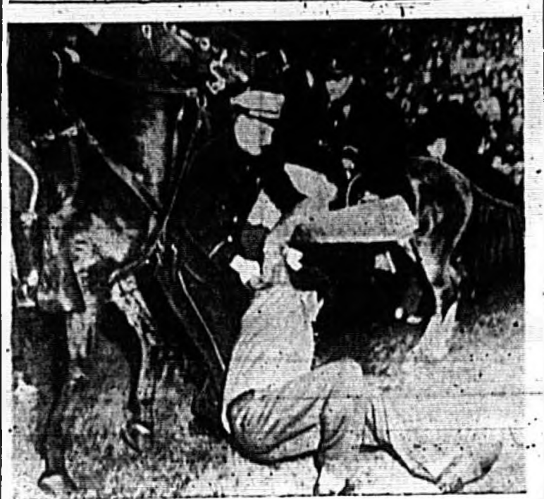
MOUNTED POLICE at Philadelphia's Franklin Field down one of Princeton's happy hoards on his own ten yard line during a scrimmage between the law and triumphant Tiger rooters who sought to get down the field to tear up the goal posts. Despite a number of spears such as this—and one of them was the upset by which the Tigers took the game from Princeton 14-17—the Princeton lads did yank up the pole.