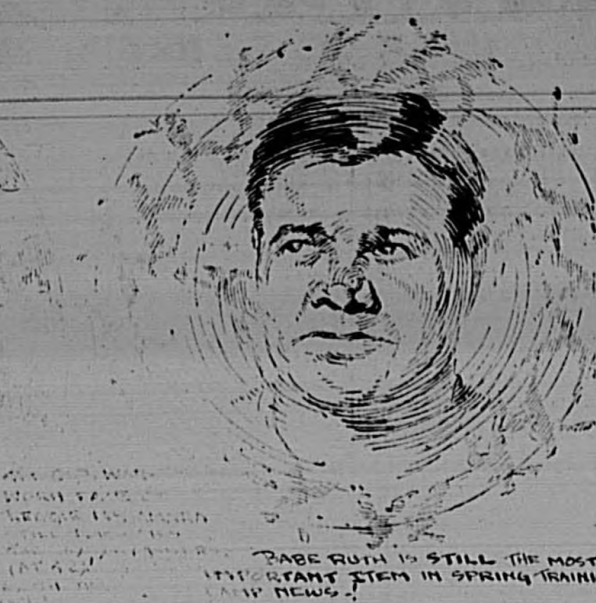
PAGE RUTH IS STILL THE MOST INTERESTING ITEM IN SPRING TRAINING