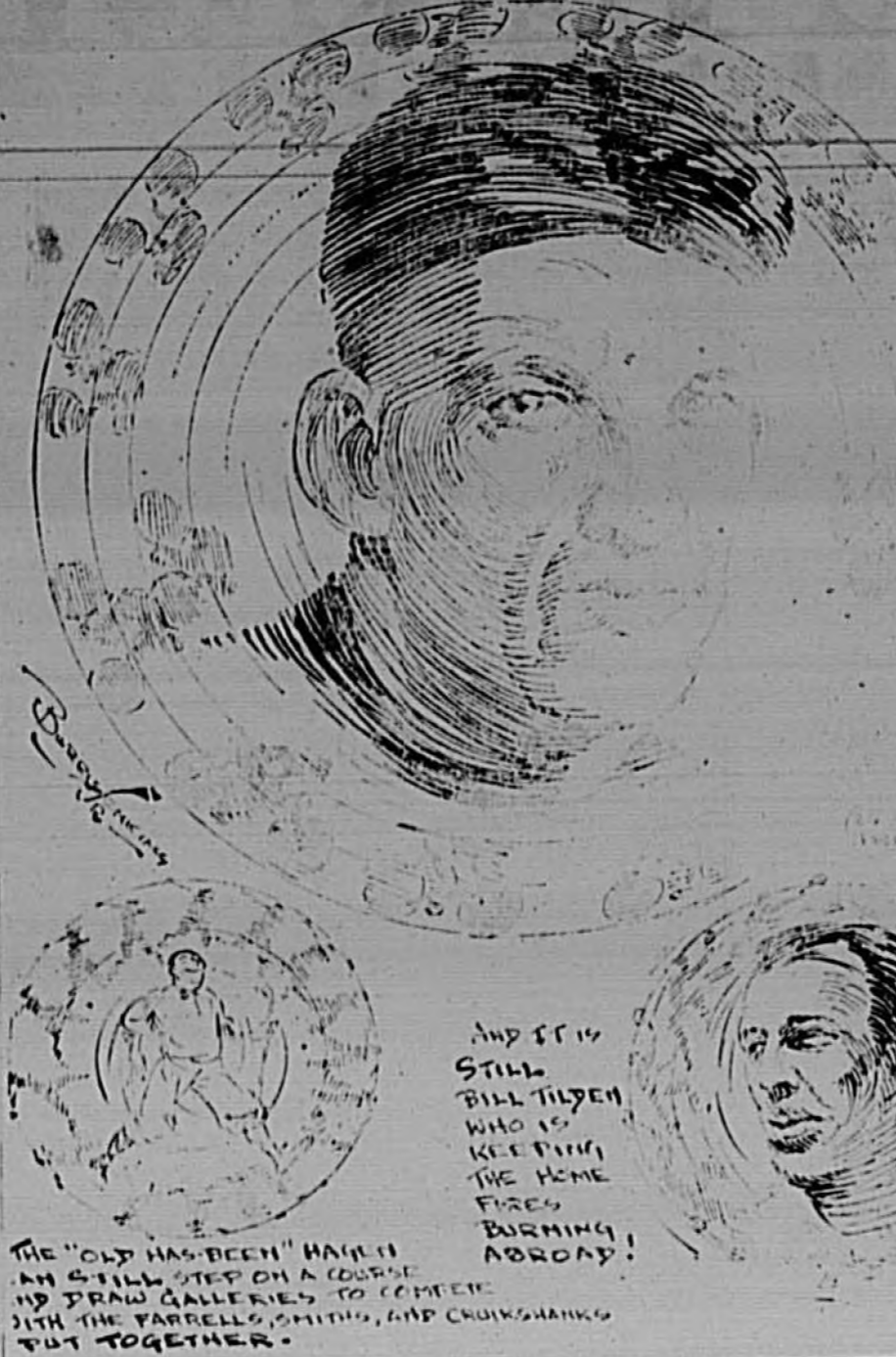
THE "OLD HAS BEEN" HAD A NEW DRAW GALLERIES TO COMPETE WITH THE FARELLO, SHINDIG, AND CRUISEMAKERS PUT TOGETHER.