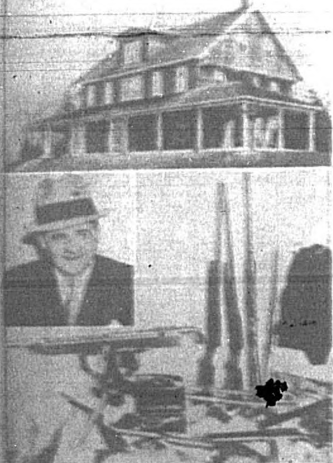
A man, possibly a detective, is seen here in a suit and hat, sitting at a desk.