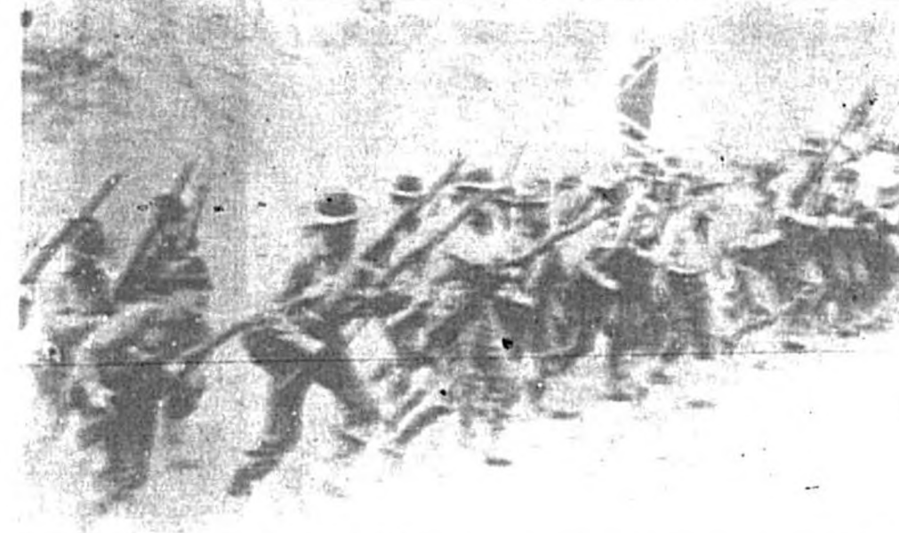
Confederate soldiers charging against Union lines during the Battle of Chancellorsville, Virginia, in 1862.