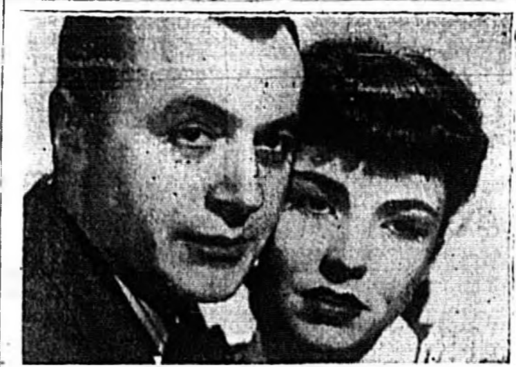
Charles Boyer and Jennifer Jones in a romantic scene from Ernst Lubitsch's saucy comedy hit, "Chiny Brown" RKO Theatre, Tuesday and Wednesday.

"Murder Without Crime" Wed. Thurs. Fri. Sat. at 8:15 P. M. Admission $1.00 plus tax Reservations 25c extra Telephone Winter Park 827-J 1 to 2 or 6 to 8 P. M.